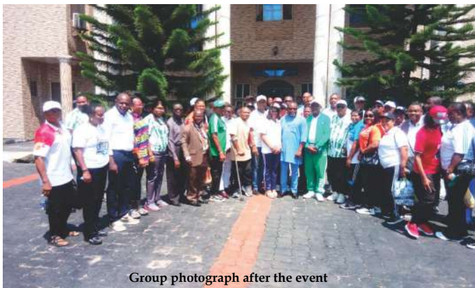
Group photograph after the event

establishment of a Sports Development Zone. According to him, the proposed zone will provide a tax-free environment for manufacturers to produce sports kits, equipment and related