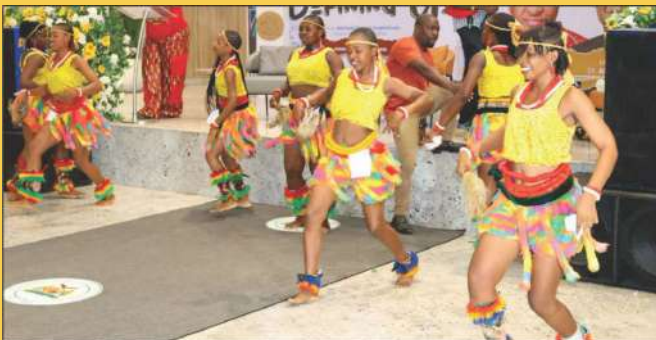
Cultural dance displays, during the 2026 CANVAS Arts and Culture Day, organised by the Abia State Ministry of Arts, Culture and Creative Economy in collaboration with the House of Crystal Empire to commemorate the 2026 World Arts Day at the Michael Okpara Auditorium, Umuahia.