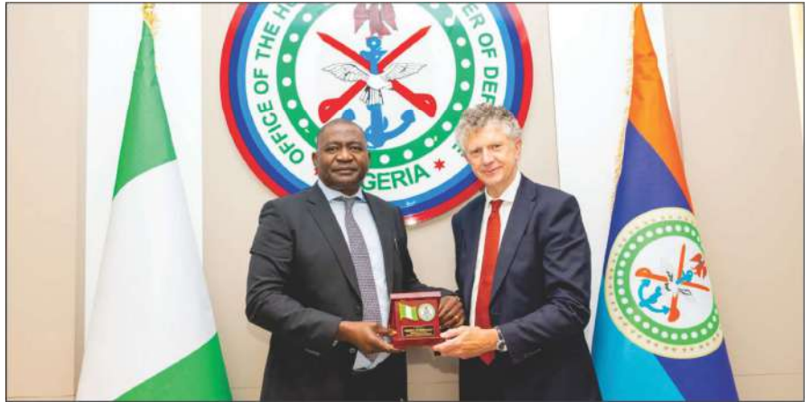
The Minister of Defense, Gen. Christopher Musa (Rtd) (Left) and the UK National Security Adviser Jonathan Powell (Right) during an event in Abuja recently.