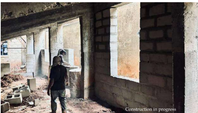
Construction in progress

The Abia State Basketball Association has commenced the construction of a hostel at the Umuahia Township Stadium to provide a conducive camping facility for basketball players preparing to represent the state at various competitions.