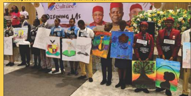
A cross section of some of the participants, during the 2026 CANVAS Arts and Culture Day, organised by the Abia State Ministry of Arts, Culture and Creative Economy in collaboration with the House of Crystal Empire to commemorate the 2026 World Arts Day at the Michael Okpara Auditorium, Umuahia.