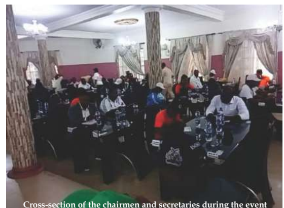
Cross-section of the chairmen and secretaries during the event

The meeting concluded with renewed optimism among stakeholders, as participants described the engagement as another significant step towards strengthening sports administration and aligning the activities of the associations with the present administration's vision for sustainable sports development