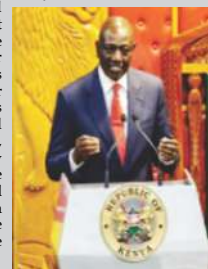
President William Ruto