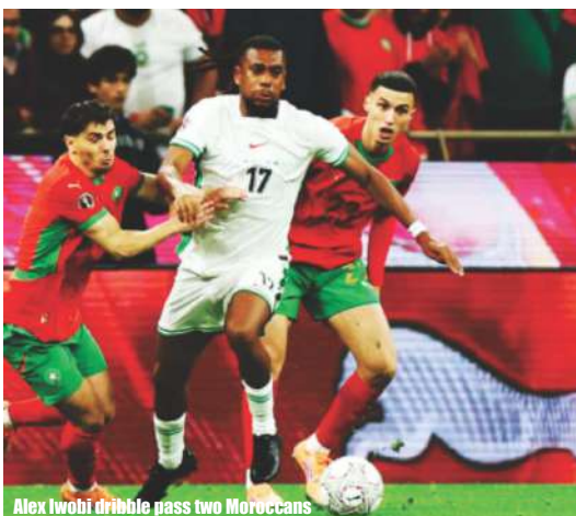
Alex Iwobi dribble pass two Moroccans

Another ugly incident was the taking of Nigeria's goalkeeper's towel by Moroccan stewards and act they repeated in the final. There is no justification for that and as Morocco prepare to host the 2026 WAFCON we hope to see a tournament where every participating team is given a level playing ground.