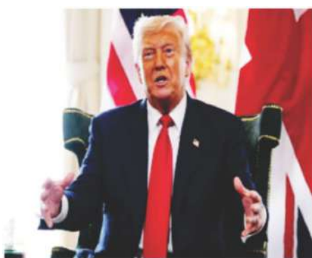
President Donald John Trump

The 2026 U.S. midterms are shaping up as a showdown over inflation, immigration, and economic confidence, inflation and cost-of-living dominate voter concerns, recent Reuters and Ipsos data shows that if the election were held today, "protecting democracy" leads for Democrats, while "cost of living" tops the list for Republicans and independents, even though headline CPI has stabilized, many households still feel price pressures, keeping the issue front-and-center, immigration remains a partisan wedge, voters favor Republicans on border security by a 46%-to-34% margin, but only 14% name it as their top issue, compared with 26% who prioritize democratic values,