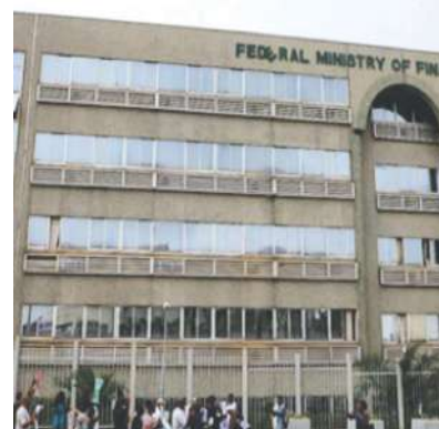
Federal Ministry of Finance

projects on time and to standard, yet our members have waited endlessly without cash backing for approved payment warrants," he said. "Our members are being pushed to the brink."