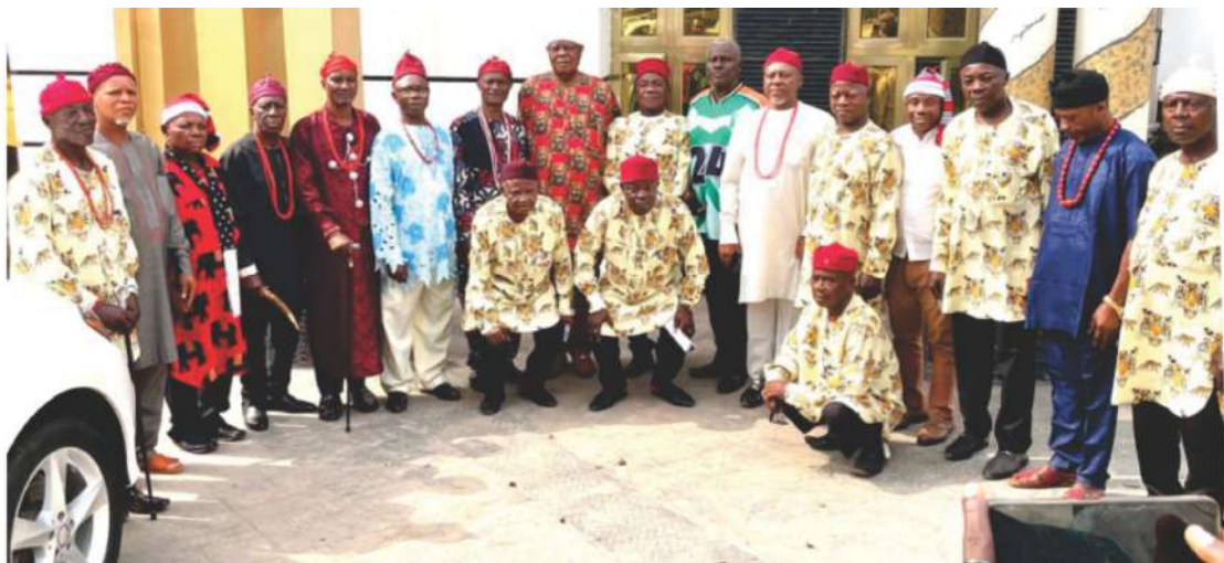
Cross Section Of Members Of The Abia State Council Traditional Prime Ministers