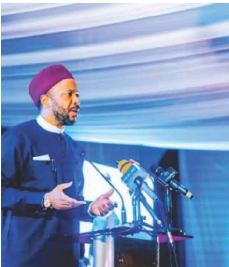
Hon. Chukwuemeka Nwajiuba.

"With his declaration, Nwajiuba joins a growing list of aspirants aiming to shape the national conversation ahead of the next general election, as debates around competence, experience, and inclusive governance continue to gain momentum," the statement added.