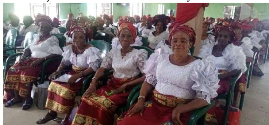
A cross-section of Oganihu Azumini women during their annual August meeting, themed 'Seizing the Moment,' held at Oganihu Hall, Azumini ukwa east LGA recently.

women to be seen as role models across other communities.