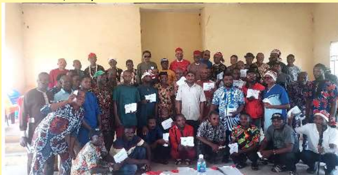
A cross-section of beneficiaries during the financial grant event for members of the Abia Arise Movement, held at the European Hall in Ndi Oji Abam Central School.