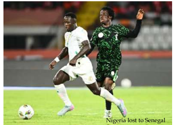
Nigeria lost to Senegal

Discovering young football talents has been identified as one of the keys to building a viable football club. Unfortunately, most Nigerian clubs do not have a serious youth team for discovering