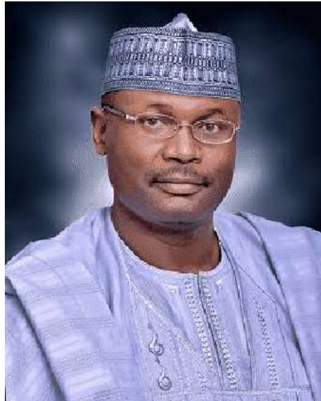
Prof Mahmood Yakubu

I must commend the INEC Chairman for his patience and for sitting down quietly to receive the CG of Correctional Services and listened to his demand. If I had mystic powers to peer into the Chairman's mind, he must have thought, when he heard the visitor was coming, that he was coming to offer help to INEC in the policing of voting stations with thousands of his armed warders and trained sniffer dogs. So far, policemen and Civil Defence people, even with armed soldiers in the background, have been unable to provide adequate security at polling stations and counting centers. Prof Yakubu must have hoped that Correctional Services was coming to offer