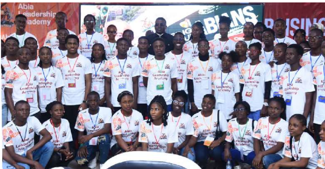
■ A Cross-section of Beneficiaries during the opening ceremony of the Abia Leadership Academy Bootcamp at Government College Umuahia, Abia State, recently.

nationalambassadorngr nationalambassadorngr nationalambassadorngr NationalAmbassador NationalAmbassador ireport@nationalambassadorngr.com www.nationalambassadorngr.com