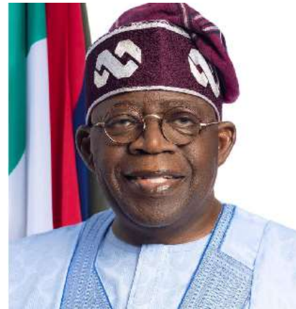
President Bola Tinubu.

He credited the President's Renewed Hope Agenda for prioritising drug control as a national security pillar, citing increased funding, inter-agency cooperation, and