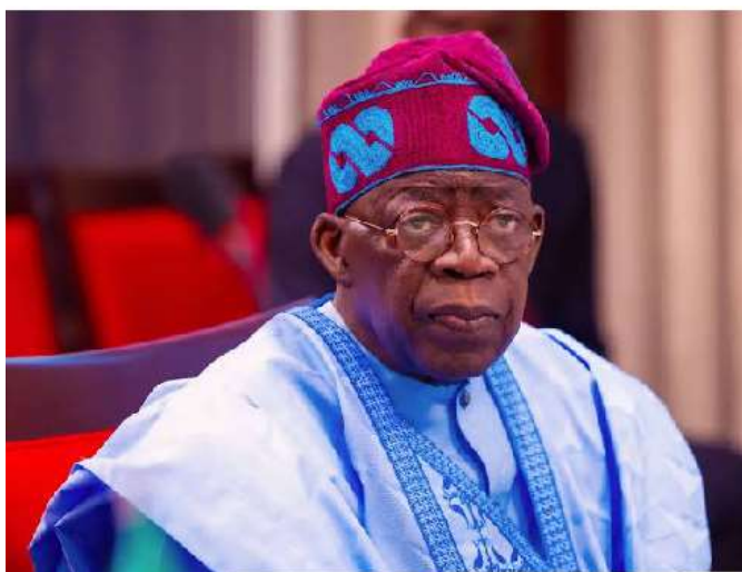
President Bola Tinubu.

Nigeria already has a version of this in