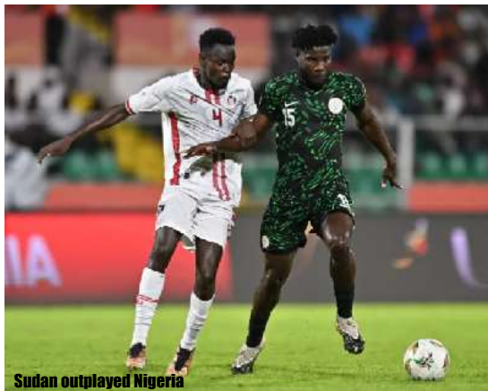
Sudan outplayed Nigeria

be motivated to win the ongoing African Nations Championship. Unfortunately, they were eliminated just after two matches.