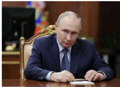
Russian President Vladimir Putin.

"The current American administration... is making, in my opinion, quite energetic and sincere efforts to stop the hostilities, stop the crisis and reach agreements that are of interest to all parties