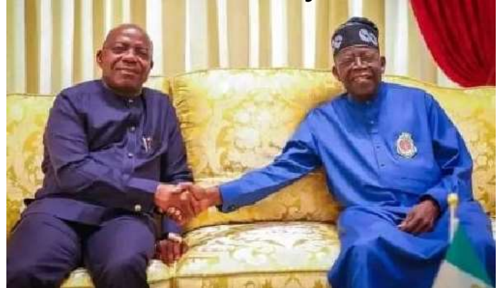
Governor Alex Otti (left) shares a warm handshake with President Bola Tinubu recently.