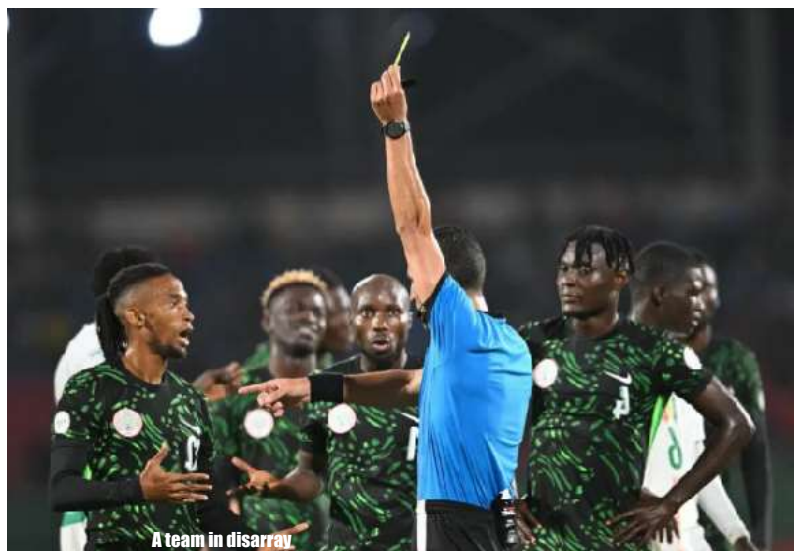
A team in disarray

and nurturing young talents to stardom. With all these problems the aim of every Nigerian footballer is to play in Europe where they will have a perfect environment to thrive. Consequently, the Nigerian Premier League is stripped of talents that would have made the league thick and produce players who will be part of the home-based Super Eagles that can compete favourably at the CHAN.