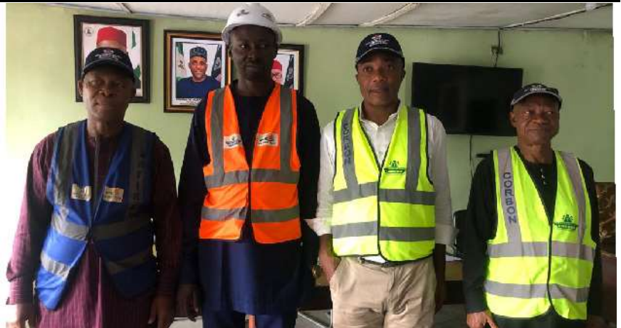
Cross-section of Executive Officers of the Nigerian Institute of Building, Abia State Chapter, during a recent press conference in Umuahia.