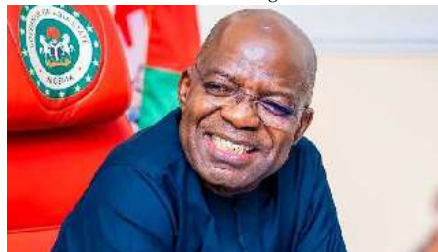
Dr. Alex Otti.

stated. The governor also extended his congratulations to other