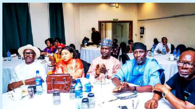
A cross section of participants during the NEC meeting of Labour party for the inauguration of the Interim National Working Committee (NWC), at the Transcorp Hilton Hotel, Abuja