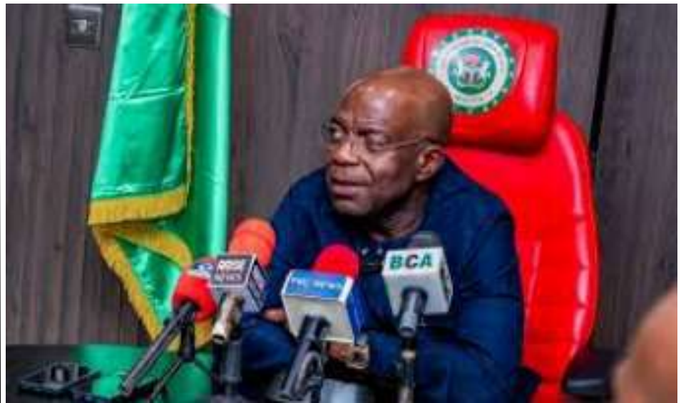
Abia State Governor, Dr. Alex Chioma Otti OFR