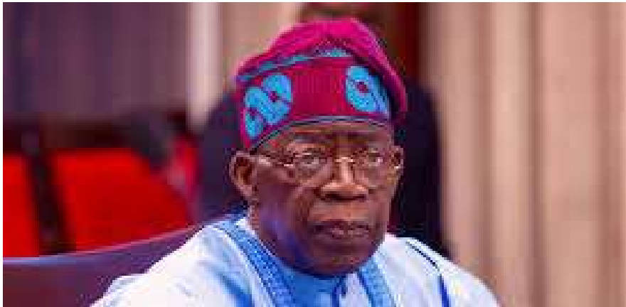
President Bola Amed Tinubu