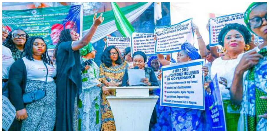
Women Advocate Group canvassing for the allocation of 182 reserved seats in the National Assembly and State Assemblies during the South-East Zonal Public Hearing on the review of the 1999 Constitution, held recently in Owerri, Imo State.