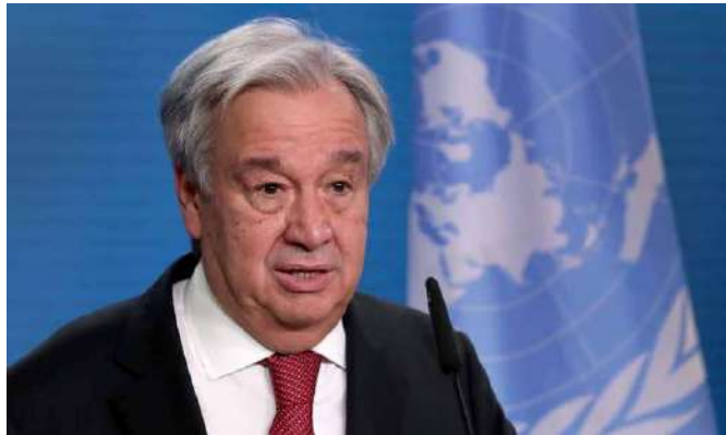
António Guterres, Secretary-General of the United Nations

Guterres signed the condolence book, writing "On behalf of the United Nations, I offer deep condolences on the death of President Muhammadu Buhari. He will be remembered for his dedication to serving others, his efforts to bring peace and