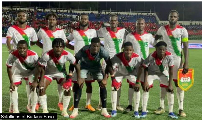
Stallions of Burkina Faso

Despite their underdog status, CAR enters the CHAN tournament with momentum and confidence. Their upset against Cameroon demonstrates their ability to challenge more experienced teams. With a balanced mix of determination and strategic play, the Wild Beasts aim to make their debut a memorable one by progressing beyond the group stage.