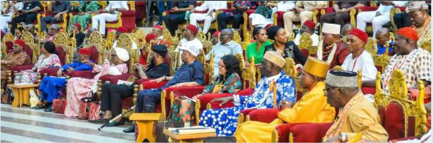
A cross section of Participants, during the South-East Zonal Constitution Review Public Hearing held in Owerri, Imo State