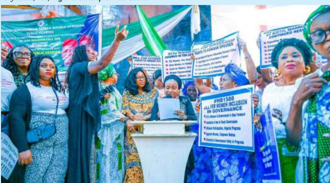
Women Advocate Group canvassing for the allocation of 182 reserved seats in the National Assembly and State Assemblies during the South-East Zonal Public Hearing on the review of the 1999 Constitution, held recently in Owerri, Imo State.