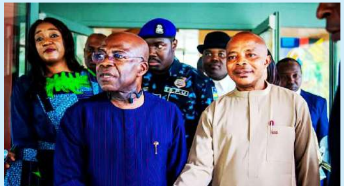
L-R: Gov Alex Otti of Abia State and President of Nigeria Labour Congress (NLC), Comrade Joe Ajaero, during the NEC meeting of Labour party for the inauguration of the Interim National Working Committee (NWC), at the Transcorp Hilton Hotel, Abuja