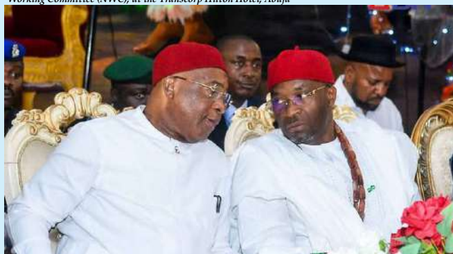
L-R: Gov of Imo State, Sen. Hope Uzodinma and Deputy Speaker of the House of Reps, Rt. Hon. Benjamin Kalu, during the South-East Zonal Constitution Review Public Hearing held in Owerri, Imo State