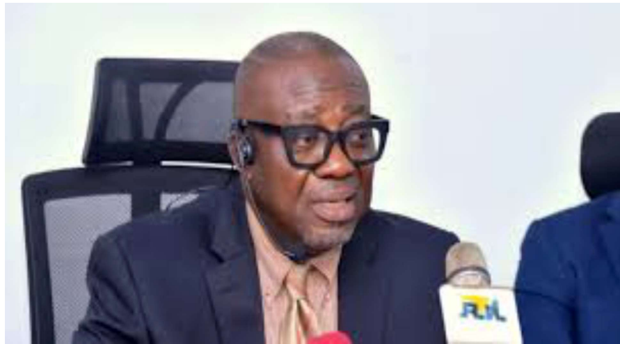
Abia State Commissioner For Information, Prince Okey Kanu