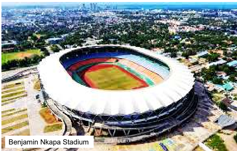
Benjamin Nkapa Stadium

the All-Africa Games held in Nairobi. The facilities include a 55,000-seat stadium with a running track and a pitch used for football and rugby union, a competition size swimming pool, an indoor arena and a 108-bed capacity hotel. The stadium is located at 1,612 metres above sea level in altitude.