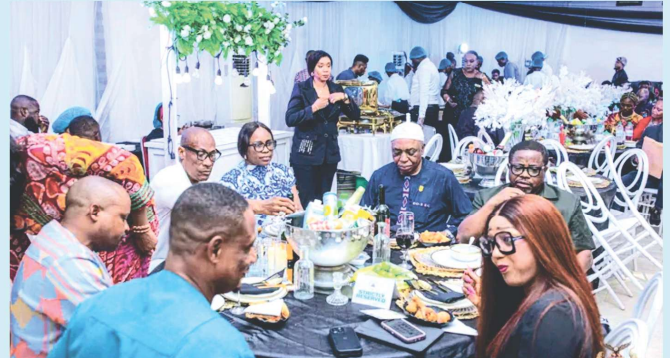
A diverse group of attendees at the welcome dinner hosted by the Abia State Government in honour of the Abia State Global Economic Advisory Council, marking the start of the 2025 mid-year retreat for government appointees.