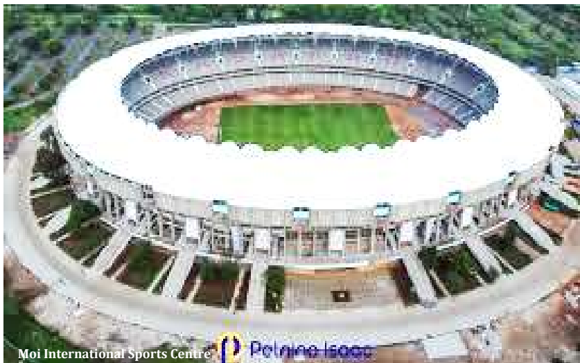
Moi International Sports Centre Polina Isop

It will host the second group stage match between Morocco