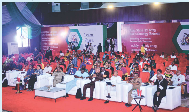
Participants at the Abia State Q2 2025 Executive Council Strategy Retreat, held at the International Conference Centre in Umuahia, recently.