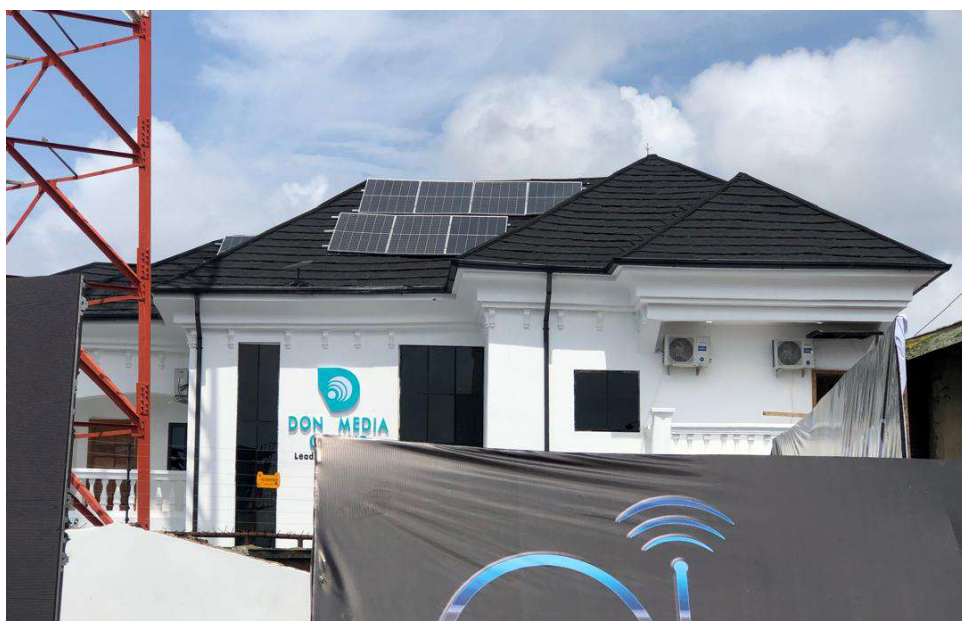
Radio Stations, Don FM, Ikoru FM