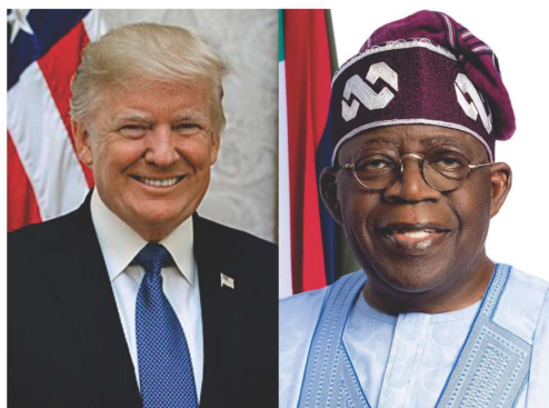
President Trump of USA

Nigeria's exclusion from the Trump-hosted summit is not just a diplomatic embarrassment; it is a wake-up call.