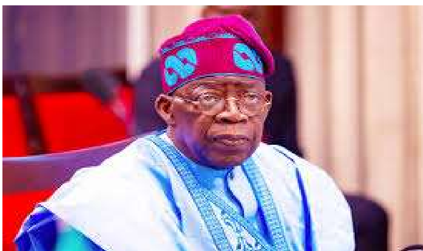
President Bola Ahmed Tinubu

The House voted to step down the bill and suspend further consideration of all pending Senate legislation.