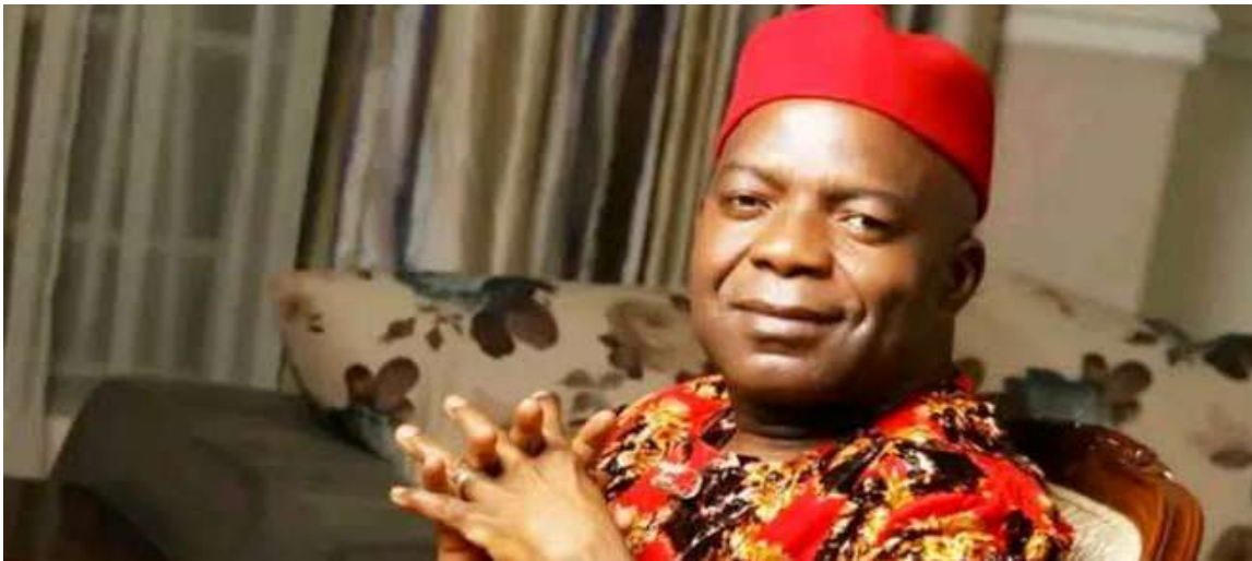
Abia State Governor Alex Otti