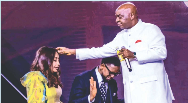
Bishop David Oyedepo, Founder of Winners' Chapel International, anointing Pastor Biodun Fatoyinbo, Founder of COZA Global, as he knelt alongside his wife during the 2025 edition of '7 Days of Glory', a yearly revival program organized by COZA Global.