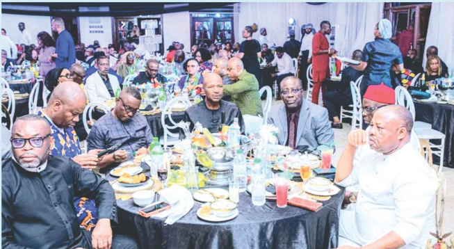
A cross-section of participants at the welcome dinner organized by the Abia State Government for the Abia State Global Economic Advisory Council, marking the commencement of the 2025 mid-year retreat for government appointees.