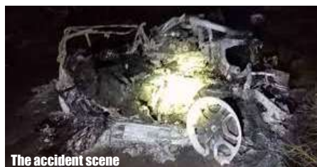
The accident scene

T he news of the death of Diogo Jota, an athlete who greatly honoured Portugal's name, and his brother is unexpected and tragic. It is a sad day for football and for national and international sports,