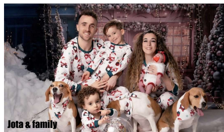
Jota & family

L et me start with Jota because this is devastating news. I am sure I speak for everyone in saying our first thoughts are going to be with his family and his friends in particular. There are millions of Liverpool fans but also football fans and non-fans who will also be shocked by this. It is devastating and really important we bear in mind just how difficult a period this will be for his friends and for his family.