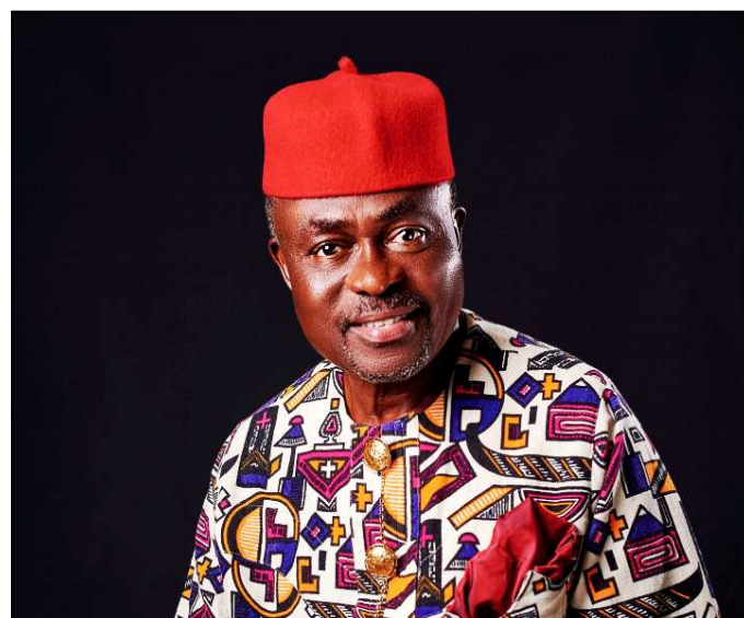
Hon. Chris Nkwonta

marked a renewed commitment to coordinated action in rebuilding the Southeast through sustainable investment and strategic collaboration.