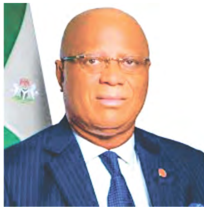
Akwa Ibom State Governor, Pastor Umo Eno

of the Senate, Godswill Akpabio applauded Governor Eno for taking the bold step to join the APC noting that the Governor from onset has been identifying and showing support to President Bola Tinubu's led administration.