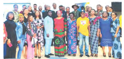
The Perm. Sec. Min of Tertiary Education and other members of the GMI

The campaign concluded with a renewed pledge from participants to foster a culture of safety, respect, and equality across all tertiary institutions in Abia State.