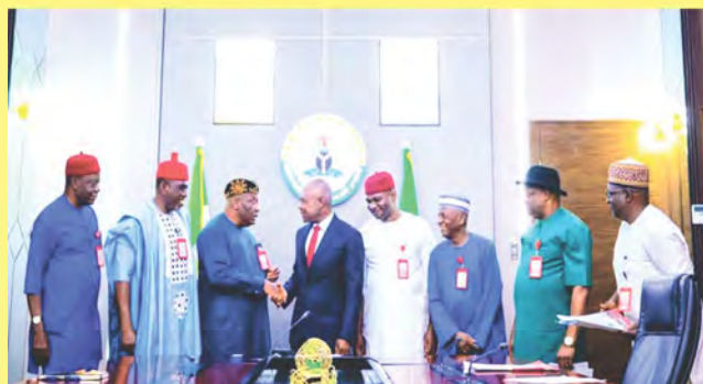
Governor Peter Mbah of Enugu State (4th left), Senator Ekong Sampson, Chairman of the Senate Committee on Solid Minerals Development (3rd left), and other members of the Committee during their visit to Enugu State.