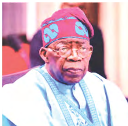
President Bola Ahmed Tinubu

"We will work with you, supervise you, and hold you accountable. Let history record this day as the beginning of Nigeria's agricultural renaissance – where modern technology meets our farmers' legendary resilience to create unprecedented prosperity," he further stated.