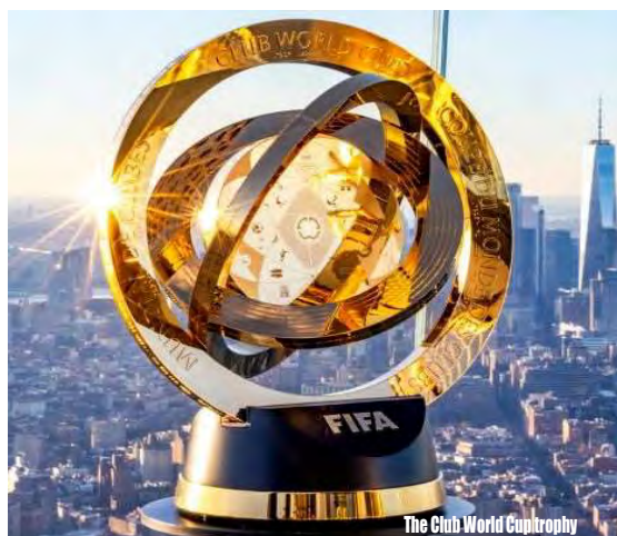
The Club World Cup trophy

All you have to do is fill the grid in such away that every 3X3 box and row and column, contains the numbers 1-9.