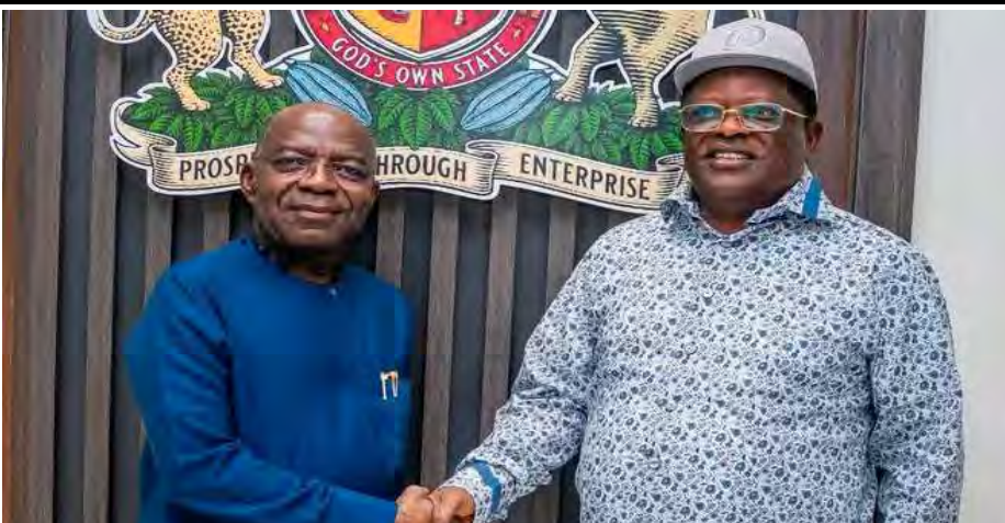
■ Governor Alex Otti (Left) in a warm hand shake with the Minister of Works, Engr. Dave Umahi (right), at the Governor's Office during the minister's working visit and inspection of ongoing Federal Road Projects in Abia State.