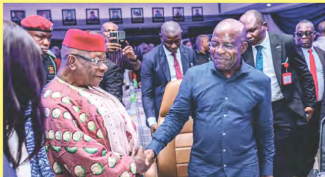
Governor Alex Otti (right) shakes hands with veteran actor, Chief Chika Okpala (left), during the 75th birthday celebration of the legendary actor, organized by the Abia State Government at the Banquet Hall of the Government House, Umuahia.