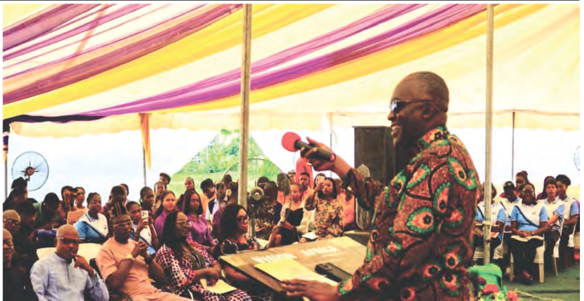
Vision Africa Media Institute Training 2025