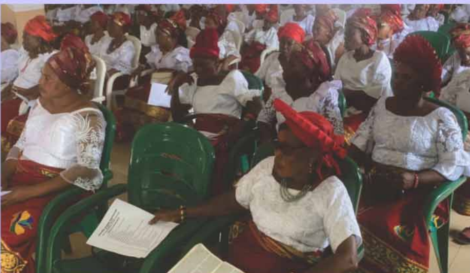
■ Cross section of Azumini Oganihu Women, during their August meeting recently in Azumini Ndoki Ukwa East Local Government.