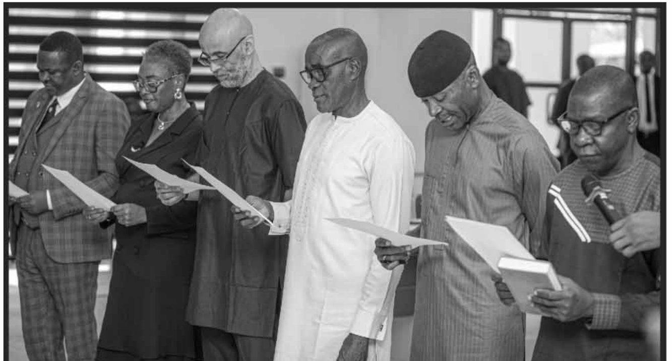
■ Cross section of the newly sworn-in Commissioners in Abia State, during the inauguration by Gov Otti in his Nvosi Isiala Ngwa LGA of Abia State

He, however, pointed out that there were minor observations that required corrections, which, according to him, is the essence of the inspection.