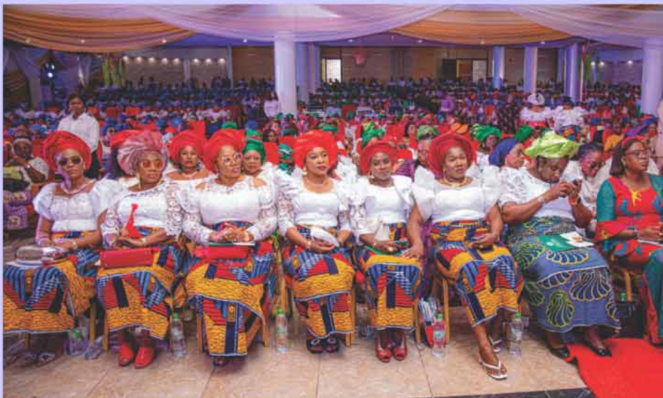
■ Some of the delegates at 2024 Abia Women August Delegates Conference (AWADEC) at International Conference Centre, Umuahia recently.