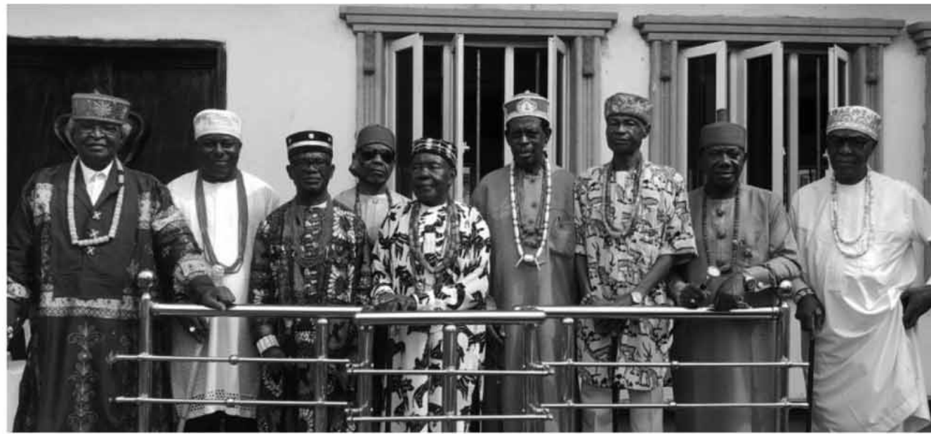
■ Cross Section of Renaissance Group Members During their monthly meeting in Umuahia.

He added that it is an aberration for royal fathers to conduct themselves in unspeakable manner, pointing that their goal is to show the light and correct the trajectory.