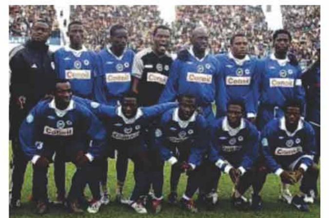
Enyimba International, Africa Conquerors

SNzogbu, nzogbu, Enyimba enyi resounded from Aba to the entire country and engulfed the entire continent. The jinx had been broken. A Nigerian club finally won the CAF Champions League.