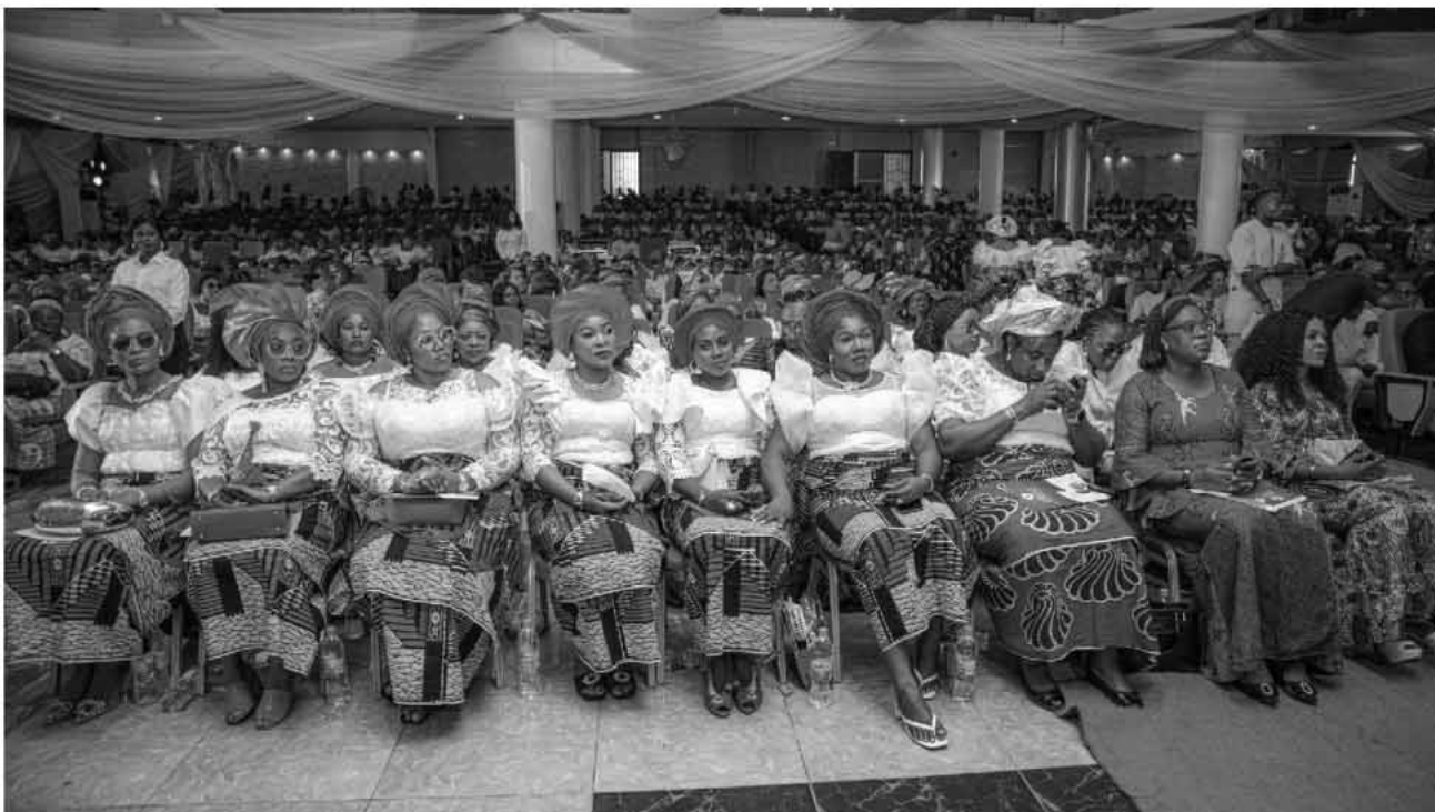
■ Some of the delegates at 2024 Abia Women August Delegates Conference (AWADEC) at International Conference Centre, Umuahia recently.

He further beckoned on other sons and daughters of Okai-Item to make meaningful contributions in building the area. He added that the purpose of community development is to bring people together to work towards a common goal, improving the quality of life in their communities. "It's a powerful tool that addresses social and economic issues, promotes inclusivity and diversity, as well, empowers communities to take action," he stated.