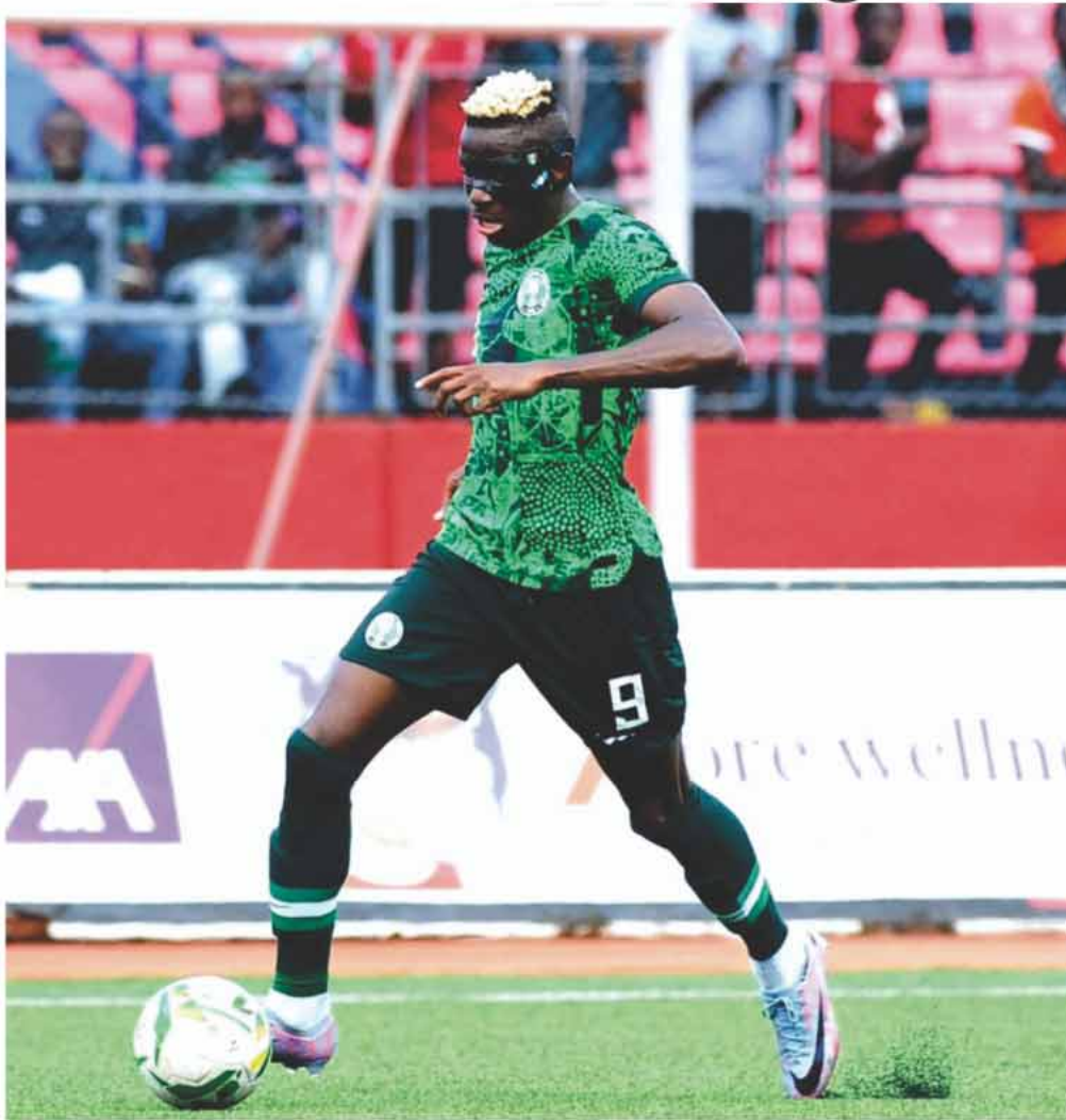
Victor Osimhen Emerge The Top Scorer In The Last Afcon Qualifiers With 10 Goals

Group E will see Algeria take on Equatorial Guinea as West African brothers, Togo and Liberia fight to finish. In round two, Monrovia will come alive when 1990 and 2019 AFCON champion Algeria visit