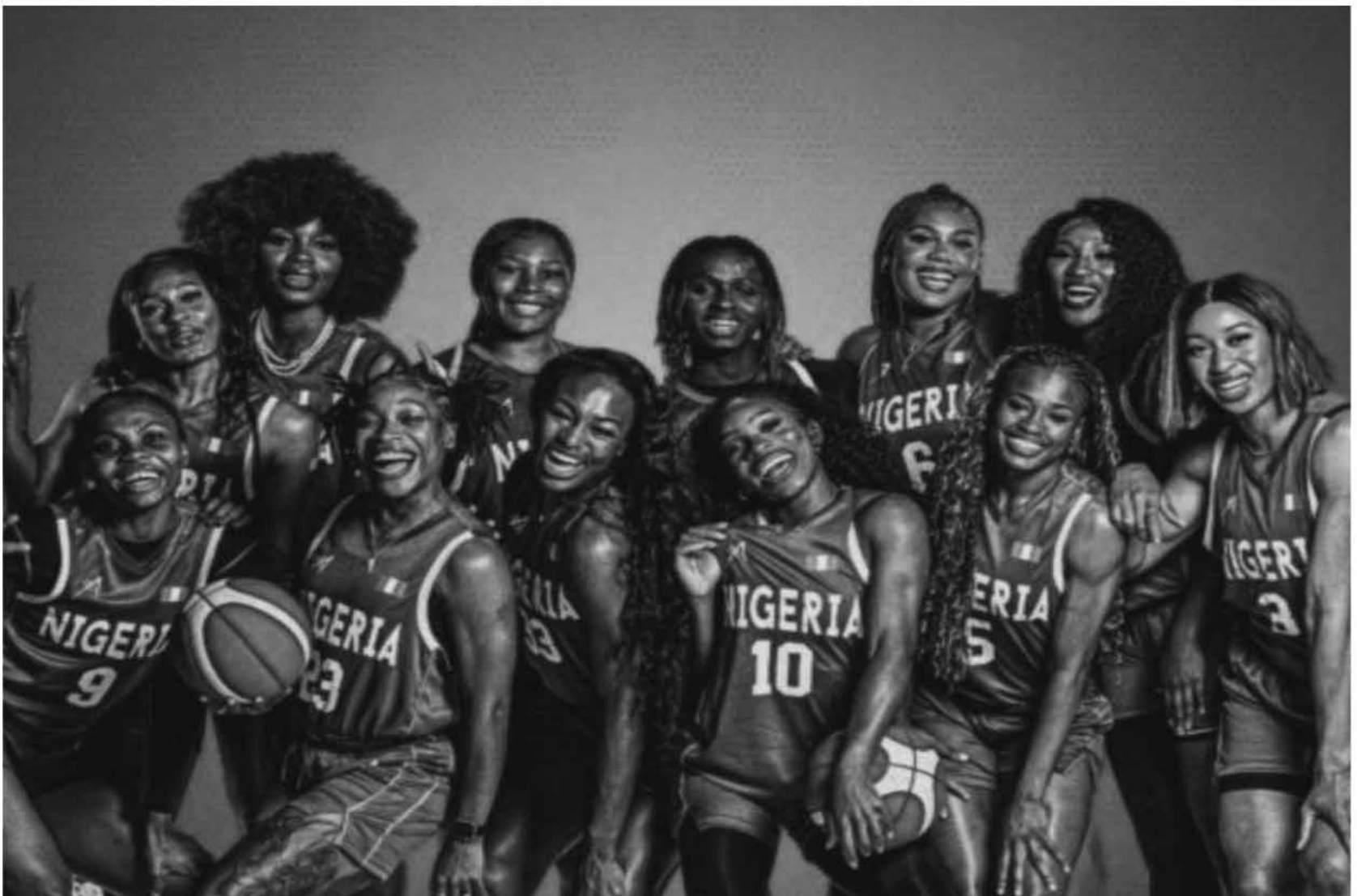
D'tigress Made Nigeria Proud At The Paris Olympics

Furthermore, there were two female athletes in Canoeing, one in cycling and 18 players for