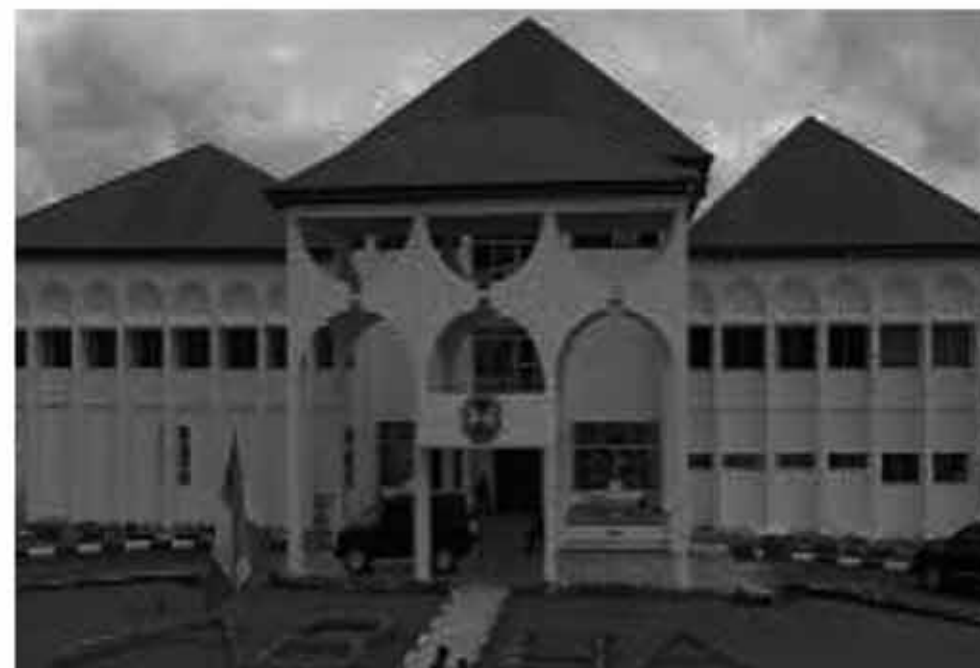
Abia House Of Assembly

This call came on the heels of a Resolution of the House of from motion of urgent matter of economic