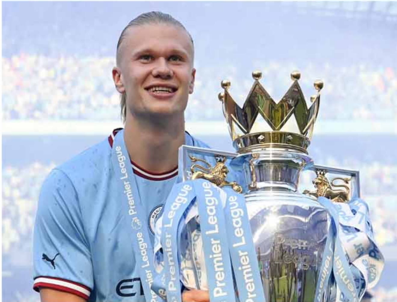
Erling Halaand with the EPL trophy

Albion was founded on June 24, 1901. German tactician Fabian Hurzeles is their new manager, while homeboy, Lewis Dunk is their captain.