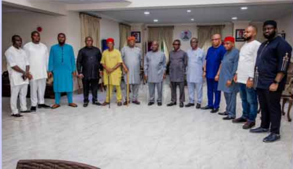
Gov Otti of Abia (middle) in a group photograph with some members of his Cabinet and Representatives of the Federal Govt, during the official hand over of the C of O for the establishment of the College of Education, Umuahia North, Abia State.