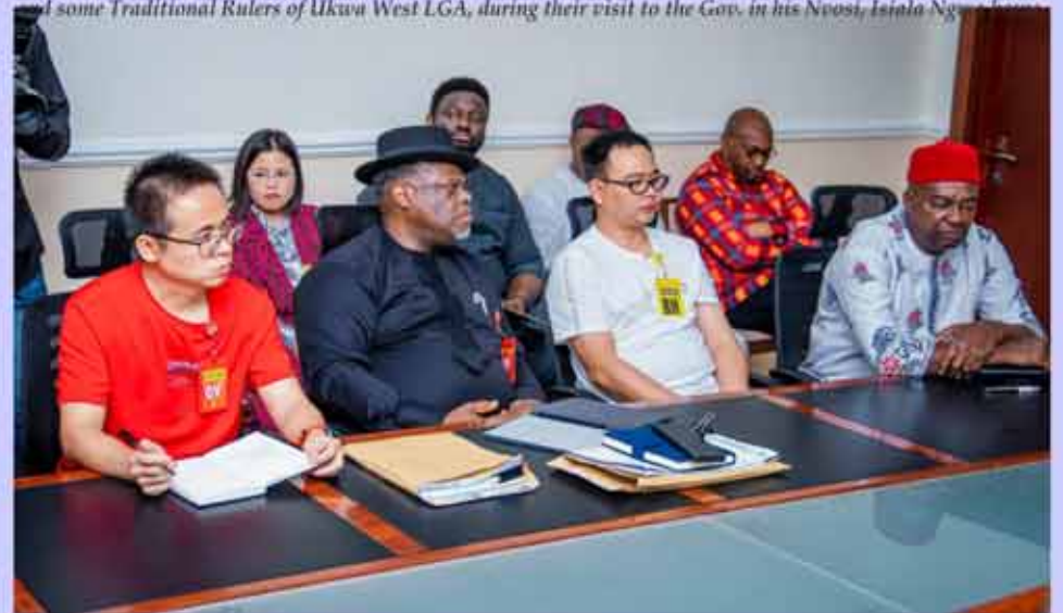
Management of the Inner Galaxy Company at Nvosi, Isiala Ngwa, Abia State.