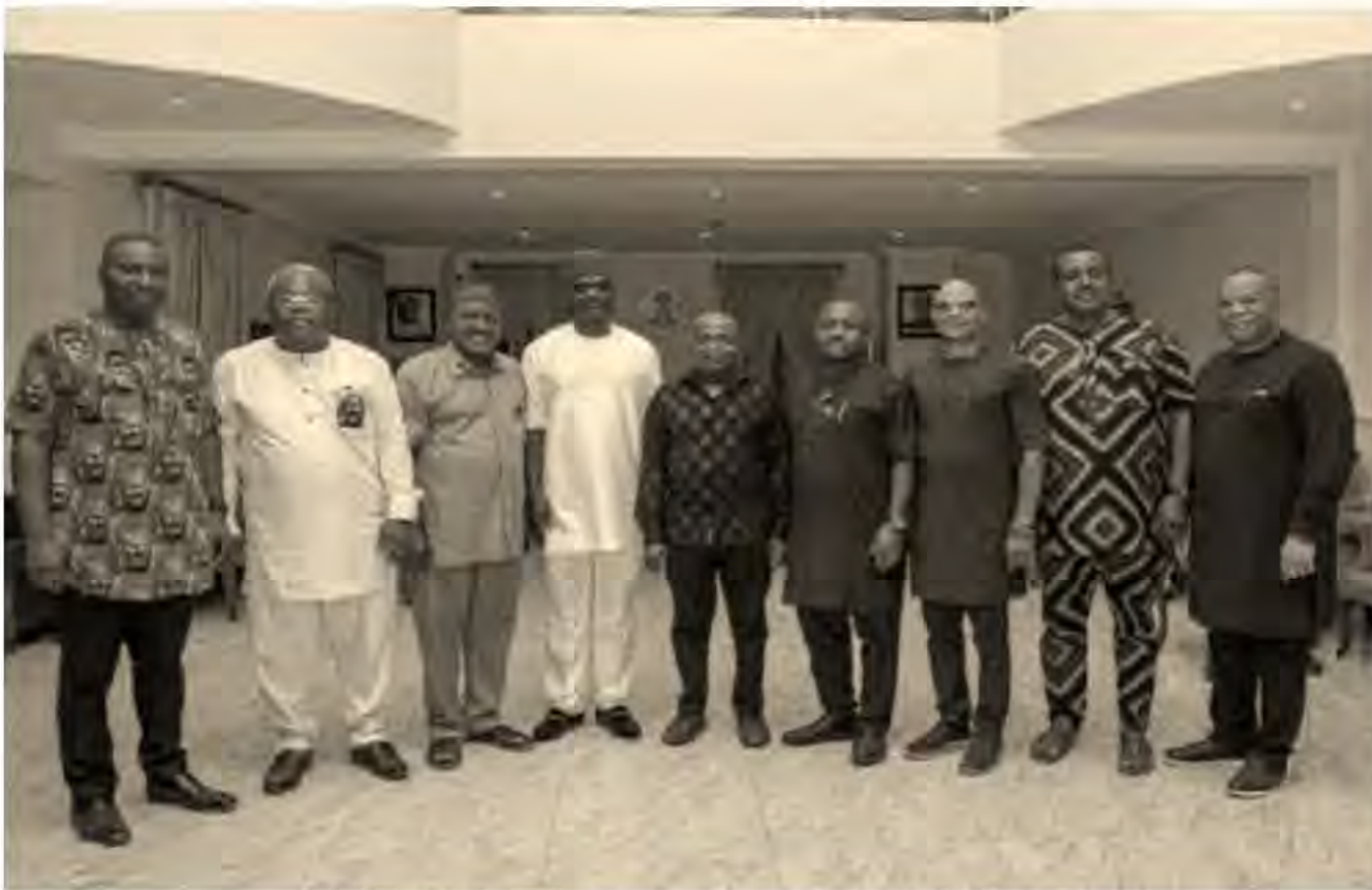
The Gov. Dr Alex Otti, (centre) with the conference of former Speakers of Abia State, recently