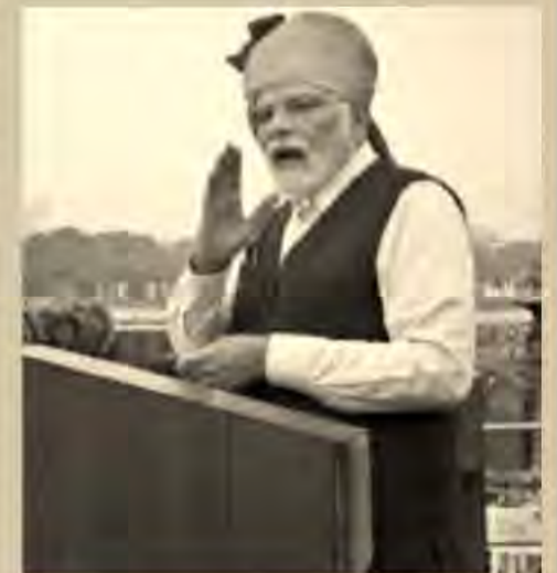
Indian Prime Minister, Shri Narendra Modi