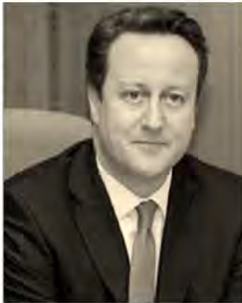
David Cameron, former Prime Minister, United Kingdom

Three medical staff told the BBC they were humiliated, beaten, doused with cold