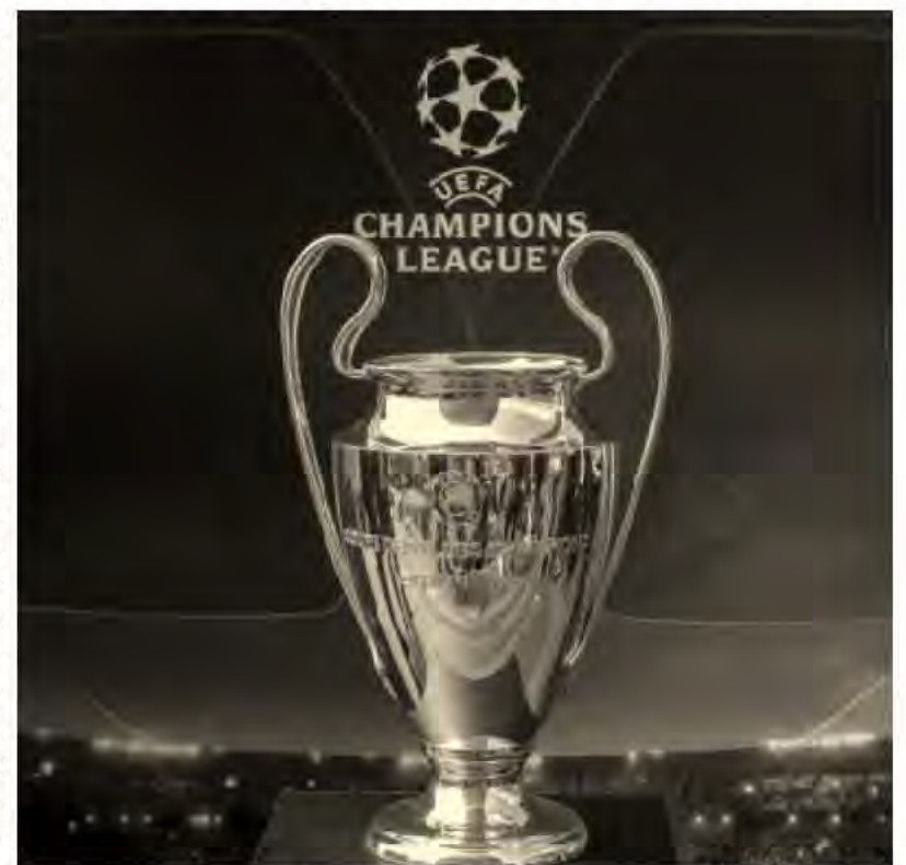
The covered UEFA Champions League Trophy

The first leg of the quarter-final matches will