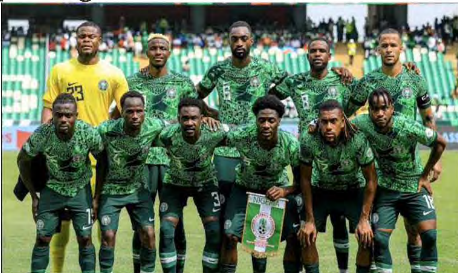
Super Eagles of Nigeria

Matches between Nigeria and Ghana are like derbies and are therefore fiercely contested even if it is just a friendly match. This Friday's encounter will not be an exception.