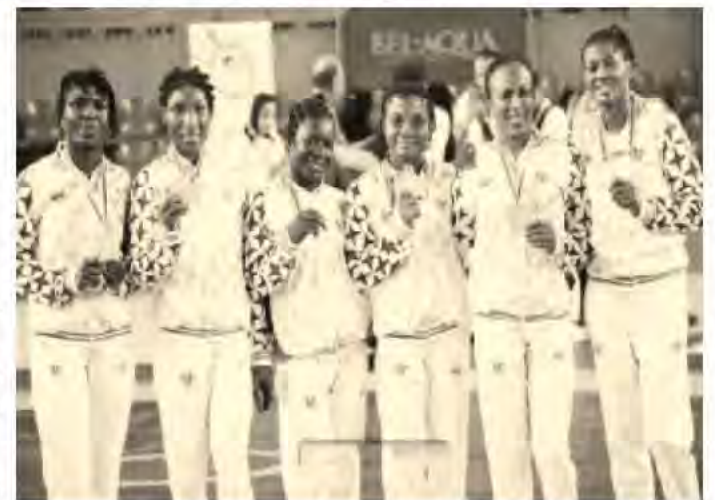
Nigerian wrestlers sweep the gold medals

So, what do you think, should the NFF go for a foreign or local coach?