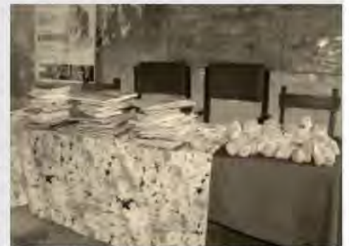
The books and some teddy bears for the kids on display