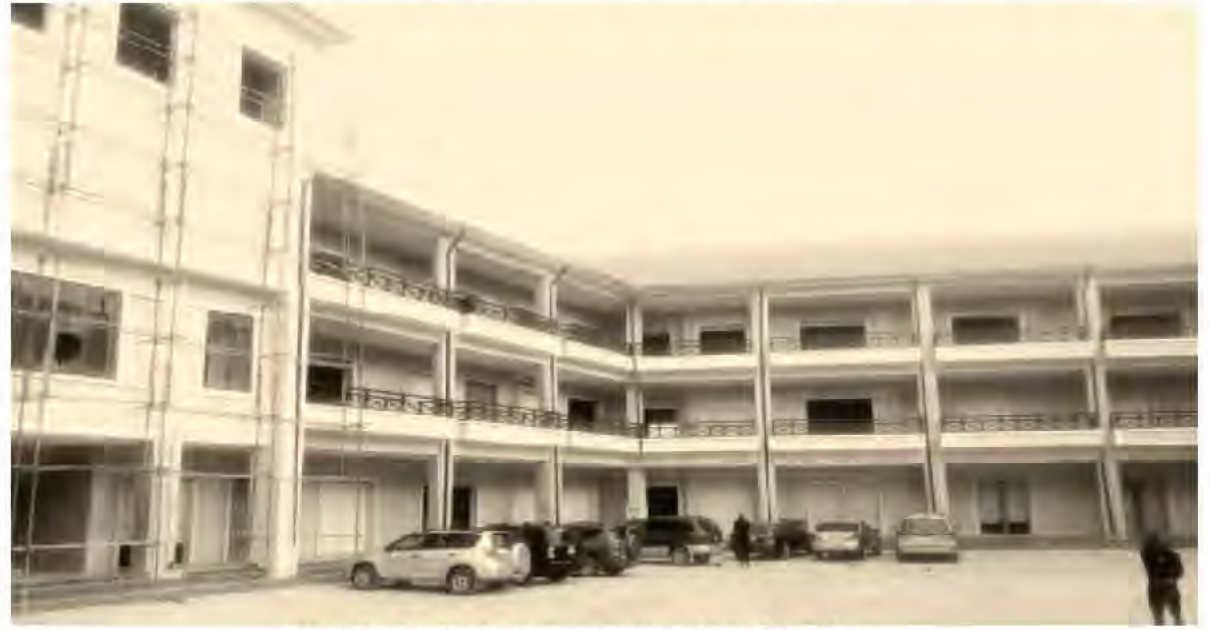
New look of Ariaria International Market, Aba

It was gathered that the first phase of the project which is 80 percent completed has unique features like fire proof doors, such that when there is a fire outbreak in a particular shop, the fire springing system on the door will quench the fire, giving no room for the fire to spring to other shops, a luxurious rest points for male and female, Internet facility, loading and offloading bay, constant water and electricity supply, elevator, spacious stores and security, for the purpose of