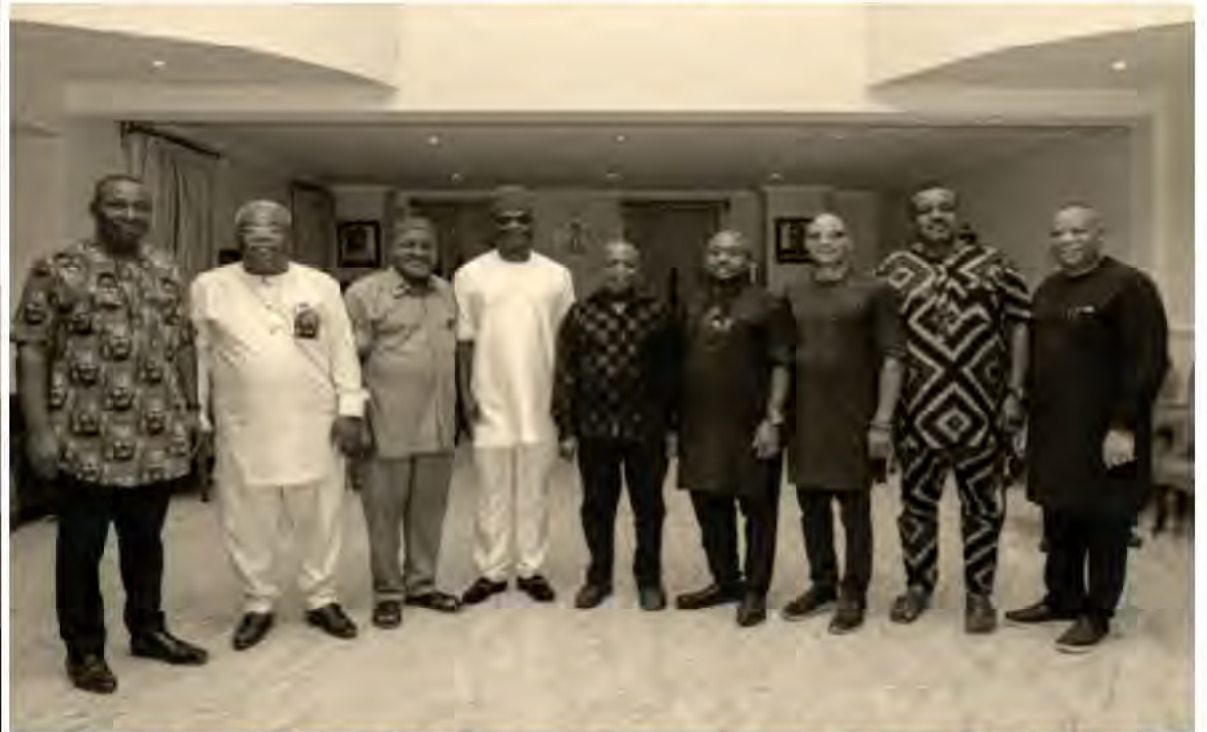
■ Gov. Alex Otti (centre), with the former Speakers of Abia State, during an event, in Aba, recently