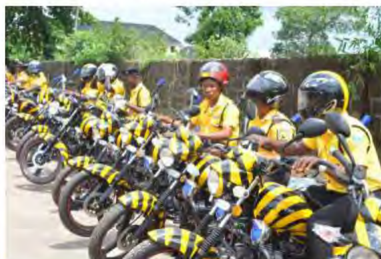
Newly purchased motorcycles for ARTSMA.