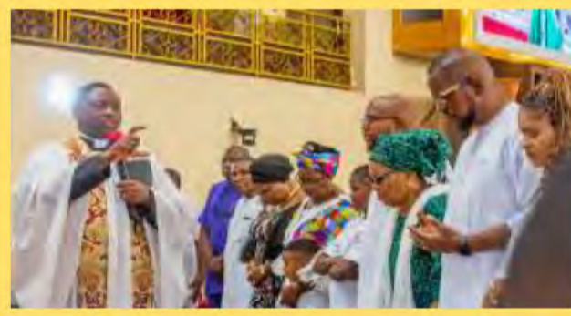
A prayer for the family