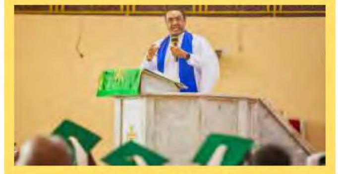
The Rev. Minister delivering his sermon