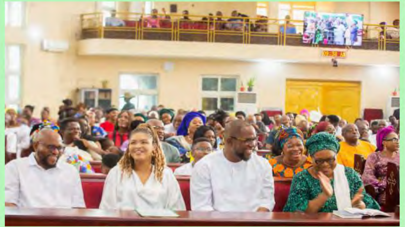
The Mbadinuju family