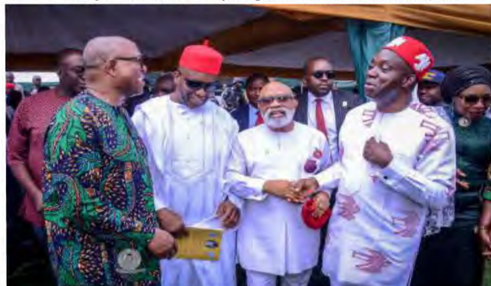
Mr. Peter Obi, Dr. Chris Ngige, Prof Charles Soludo enjoying banter at the funeral