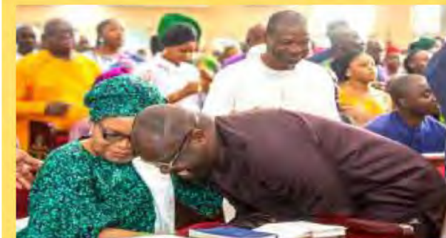
Odera's wife in a chat with a relative