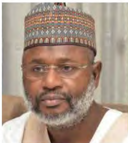
Alhaji Sani Yerima of Zamfara state