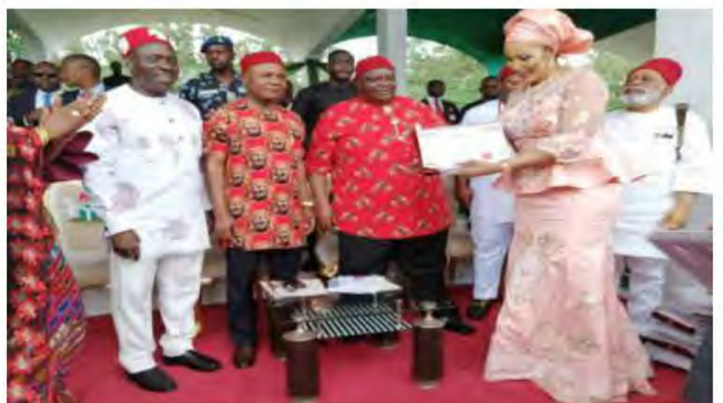
Gov. Soludo, Gov. Peter Mba, Chief Emmanuel Iwuanyanwu, Dr. Chris Ngige and Mrs. Bianca Ojukwu