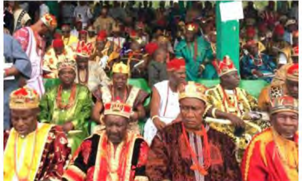
Igbo Traditional Rulers

The formation of MASSOB proved most capable of commanding public attention all over the country and the reasons were quite obvious. Though MASSOB had no real potential to levy war against the Nigerian State, yet it had the advantage of using Biafra whose historical antecedents are to