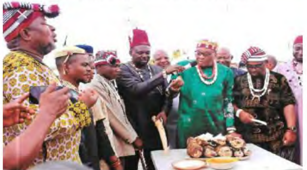
Igbo Traditional rulers