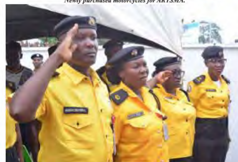
A well-motivated staff of ARTSMA.