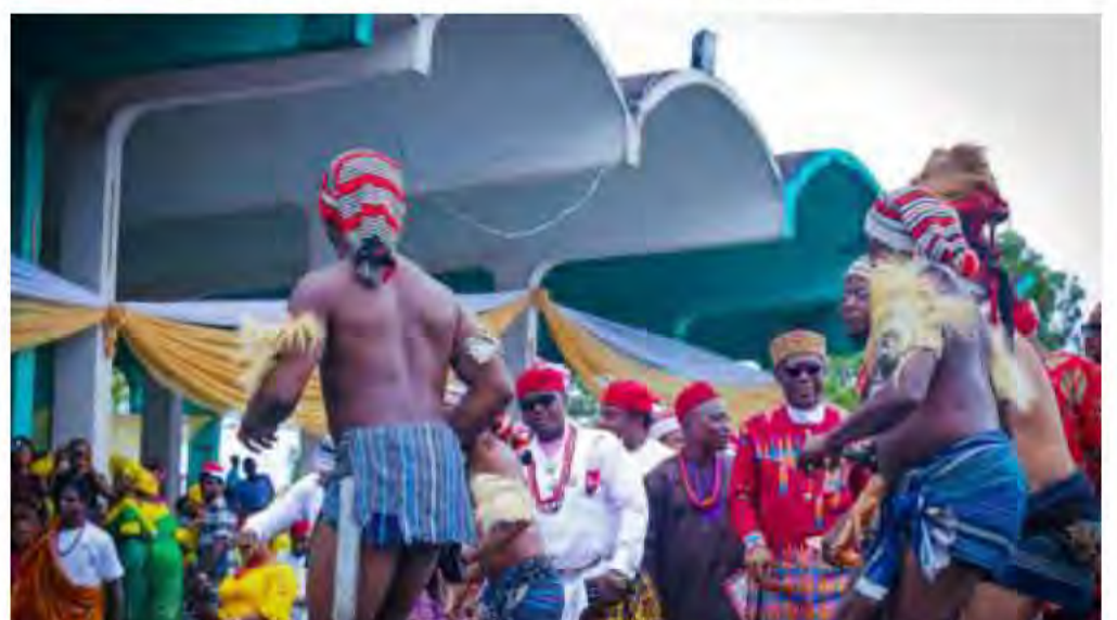
The famous Igbo war dancers