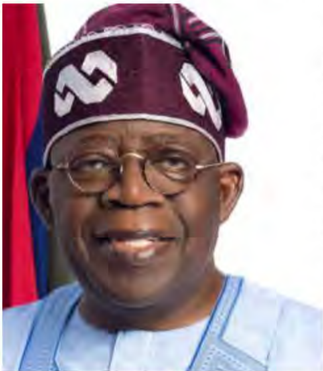
President Bola Ahmed Tinubu

The contemporary main challenge of the Igbo's in their response to the national question still remains how to reconcile the differing ideological position between Ohaneze and the Separatist movements now led by IPOB. The reconciliation of ideological positions on the national question between Ohaneze and IPOB and other separatist groups is very important because the substantives issues raised by the recurring problems of the national question is still quite urgent and threatening.