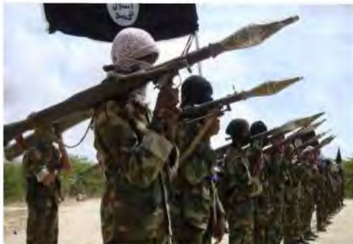
Boko Haram fighters

cultures. That in itself is the very condition for growth and regeneration. A single Igbo nation may be more prosperous, but will be less interesting, and that is the more valid argument"