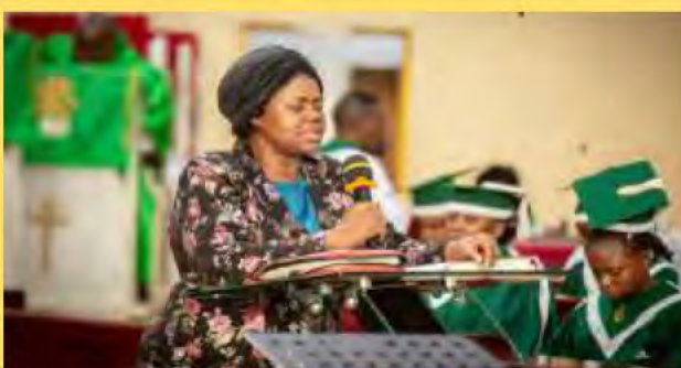
Sister of the deceased