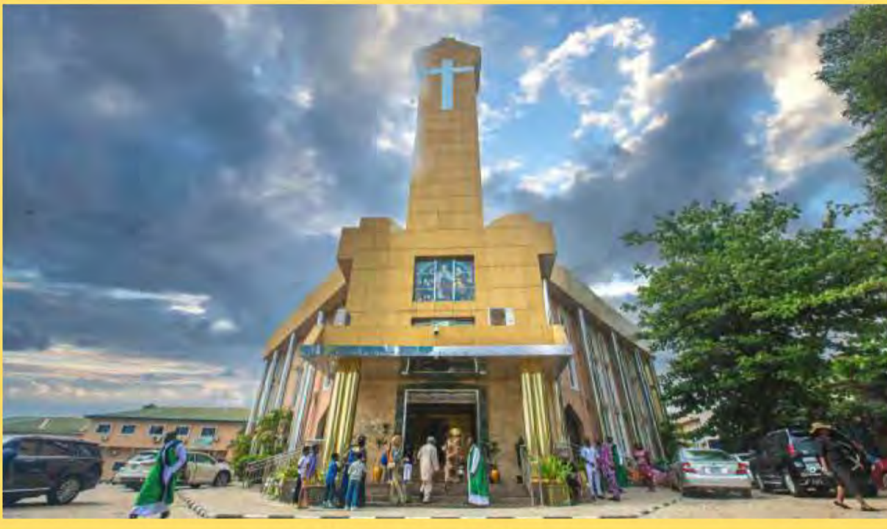
St. Matthew's Anglican church Maitma