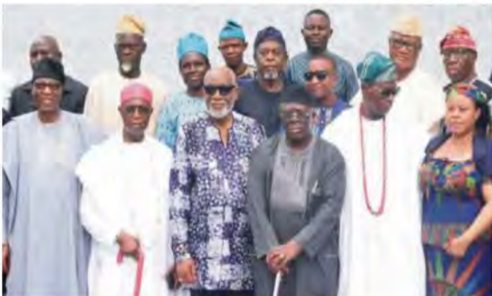
Afenifere leaders of the southwest

is an ardent advocate of a restructured and balanced federation where everybody's right is guaranteed under the law no matter the religion, class or ethnicity. The apex Igbo socio cultural body is of the view that Igbo's having a large migrant population and businesses all over the country are better off in a restructured and balanced federation in which fairness, equity and justice is guaranteed to all. It is in this