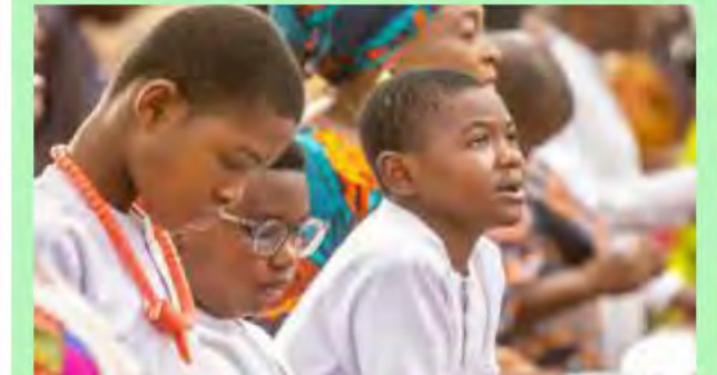
The Mbadinuju Grand Children