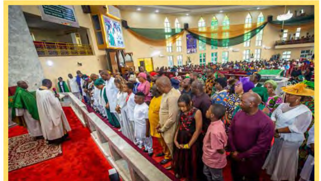
A prayer for the family