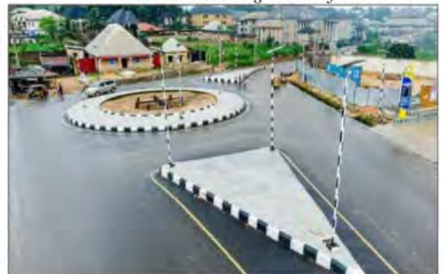
The newly constructed Emelogu Road