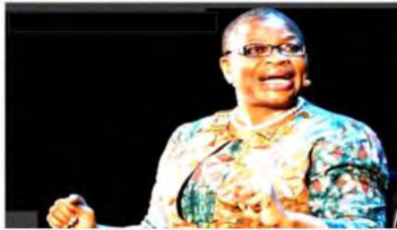
Former Minister of Education, Mrs. Oby Ezekwesili delivering a virtual seminar