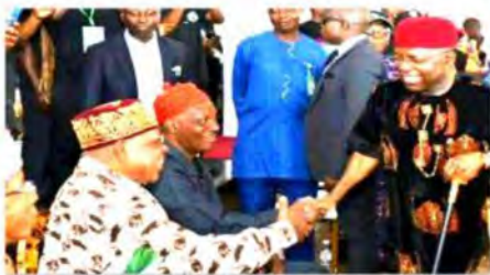
Gov. Otti exchanging greeting with traditional rulers at the event