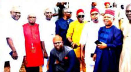
Some of the guests that graced the occasion