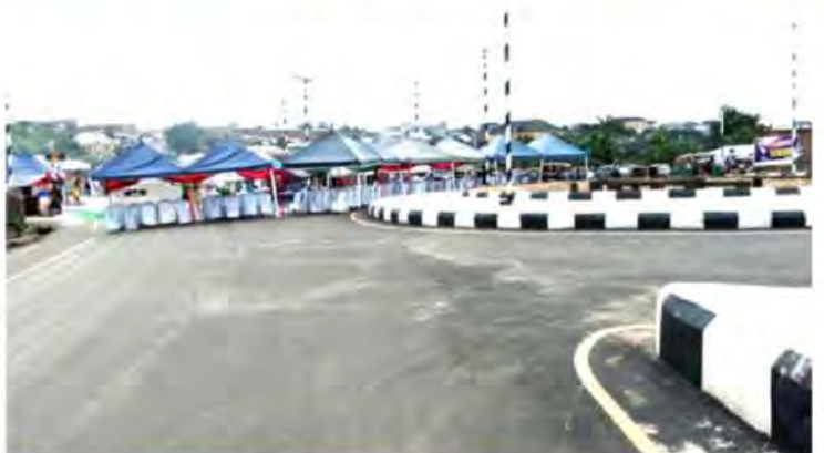
The Newly Constructed Cemetery Road Aba