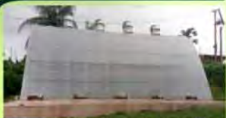
Automated Solar Dryer at Abia ADP for drying agricultural produce for exports