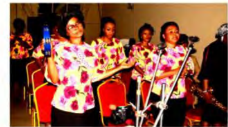
The Church Choir was equally in action