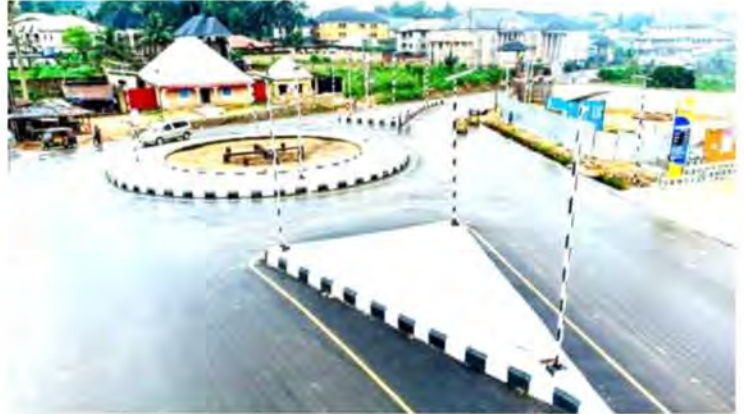
The newly constructed Emelogu Road