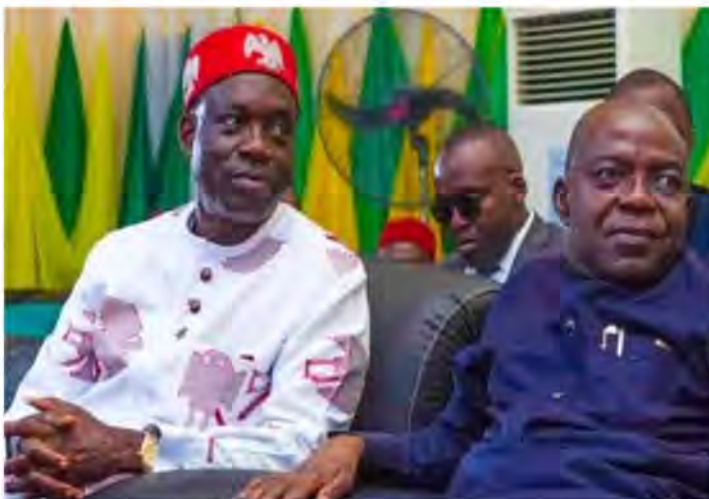
Dr. Alex Otti and his Anambra State Prof. Chukwuma Charles Soludo during the maiden Dr. Michael Iheonukara Okpara lecture series at MOUAU

It was therefore an opportunity for celebrations as the university rolled out its drum and garlands to celebrate the giant milestones it has attained in its 30 years of existence. This year's