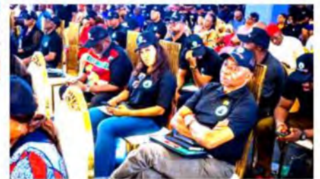
Cross Section of people at the event