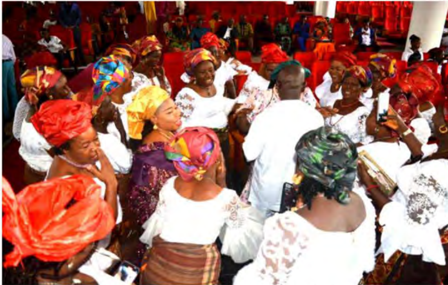
Cross section of the women at the thanksgiving service