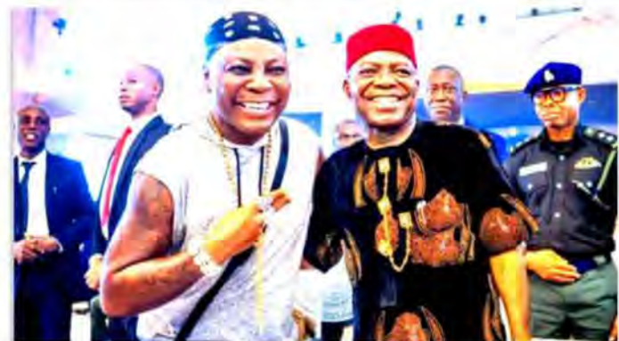
Governor Otti with area father, Charly Boy at the Abia @32 anniversary celebration

According to him in the speech "Good roads, quality health care, standard education, adequate security in our communities and other social service are desired by everyone in every community. However, you will agree with me that none of these will materialize if the citizens do not pay their taxes promptly and correctly"