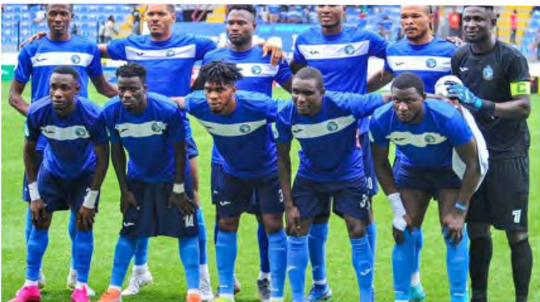
The winning Eyimba Football Club