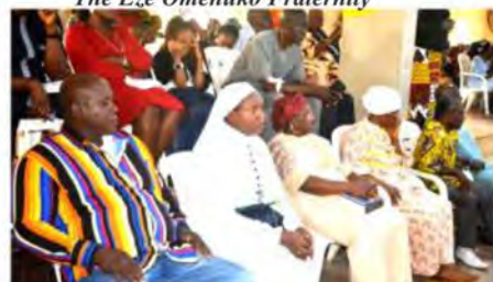
Some women that graced the occasion