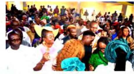
Another section of guests at the reception