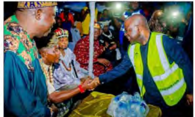
Governor Otti with the Traditional Rulers of Aba during the commissioning ceremony