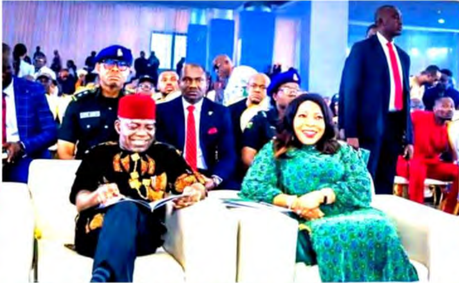
Gov. Otti and wife, Priscilla, during the anniversary celebration