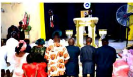
More prayers for the Akparas