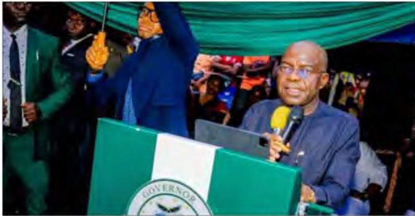
Governor Otti making a speech at the commissioning of cemetery Road

Abia State was for decades known for its very bad road infrastructure.