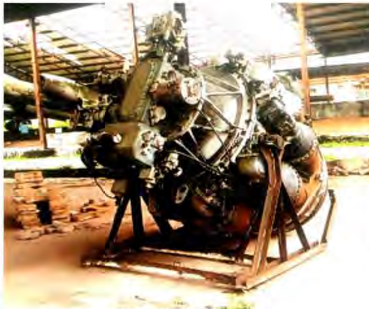
National War Museum Umuahia

Ans: There are no indices for me to start because Dr. Alex Otti just came in, so where am I going to start saying anything? Maybe I might say I feel a lot of positive reactions, for an instance, at the Isigate, it may be elementary to you but it seems that one big thing has happened at the Isigate, just tarring the place and making it motorable. It is not a rocket science and you just keep wandering why these people did not do this thing, he just came in the other day and sorted that place out and some many other places as well. You wonder what happened to the last administration, that it took them as if they were building space scrappers to the Mars, you don't just understand them. I believe Dr Alex Otti has the requisite qualifications and the character trait to turn things around.