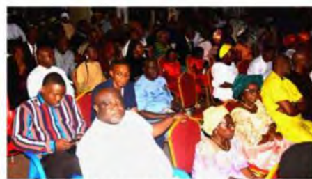
Hon Boniface Ishienyi of Abia House of Assembly