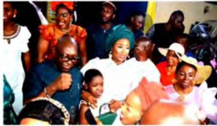
Akpara with relations and friends