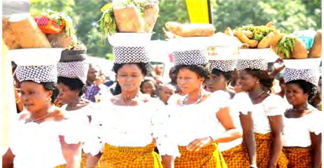
Igbo women showcasing the king of crops-yam during the Iri ji festival

Ans: We should have our new year calendar properly defined, define our new year festivals properly, when defined, you will find out that every other thing will continue to fall into place, we can then talk about tourism and so on. We have not been able to put in place what will draw people to come down here so that our tourist sites