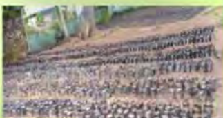
Nursery section just planted with improved seeds against 2024

T he Programme Manager, Management and staff of Abia State Agricultural Development Programme heartily Congratulate our chosen and ebullient agricultural friendly Governor, His Excellency Dr. Alex Chioma Otti OFR on the successful and eventful 100 days in office.