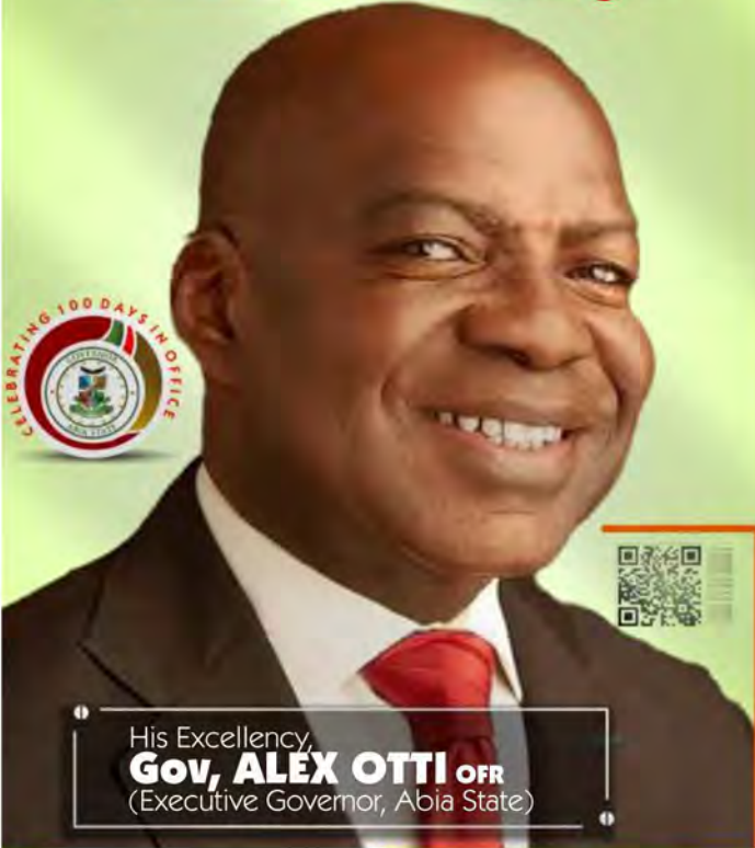
His Excellency, Gov. ALEX OTTI OFR (Executive Governor, Abia State)