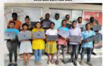
Job creation of Agric-tech to boost Agricultural marketing