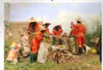
Beneficiaries of 30 hectares of cassava cluster, Ohambelo Ukwia East LGA, Abia State