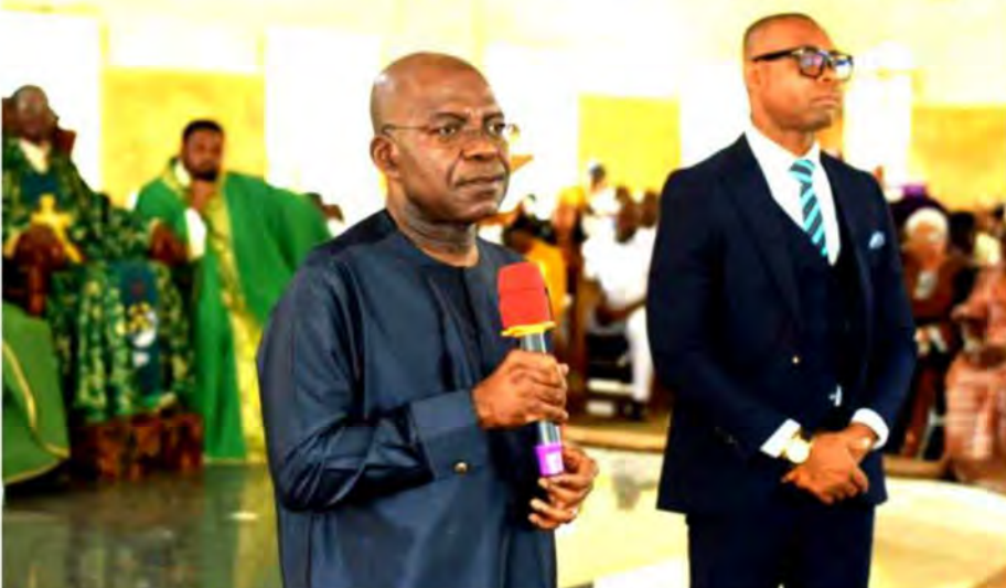
Gov Otti speaking at the dedication Church service