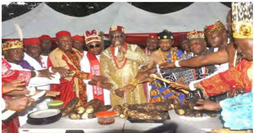
Traditional rulers praying during the new yam festival

Q: We are in the season of plenty (harvest), which heralds the new yam festival, which is a very important festival in Igbo land. Have we been able to manage well such a big cultural heritage well?