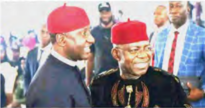
Gov Otti with the Enr Minister of State for Solid Minerals, Dr. Uche Ogah, during the Abia @32 anniversary celebration in Umuahia recently