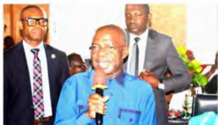
The Governor speaking at the event