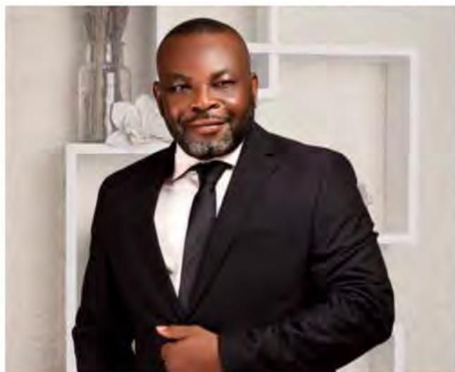
Sir Nwaobilor Anababa the Hon. Commissioner for Sports

In the area of boxing, the ministry has sponsored a boxer with Abia State Sports Council to participate in the boxing trials organized by the Nigerian Boxing Federation at the National Stadium, Lagos in preparation for 2024 Paris