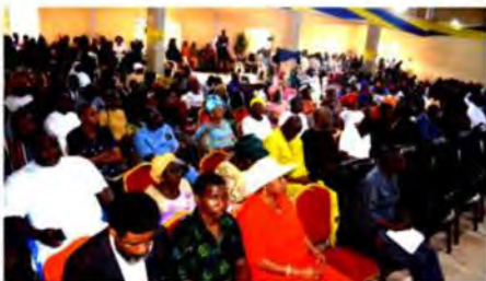
Guests at the reception