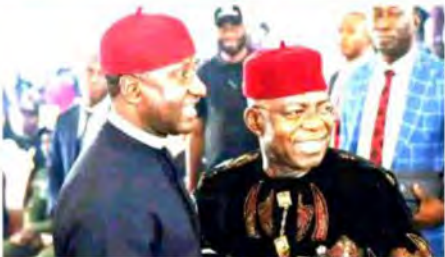
Gov. Otti with Former Minister of State for Solid Minerals Development Dr. Uche Oguh