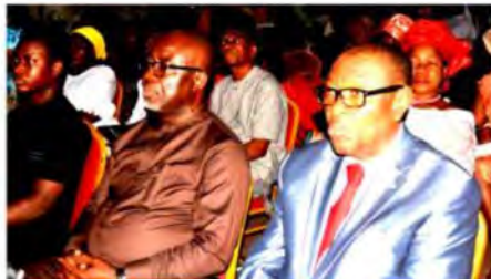
Commissioner for Information, Prince Okey Kanu & Commissioner for works Mazi Otumchere Oti during the event