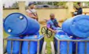
Beneficiaries of Oil palm marketing input