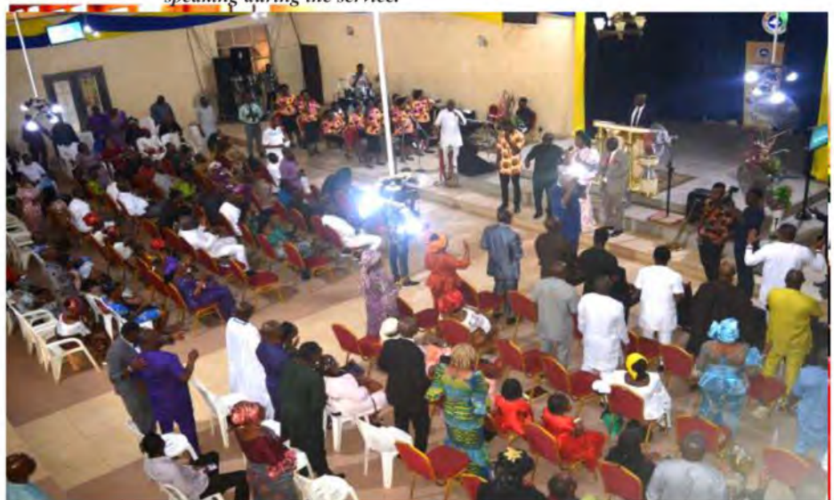
The Church Congregation