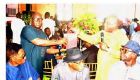
Another cross section of guests at the event