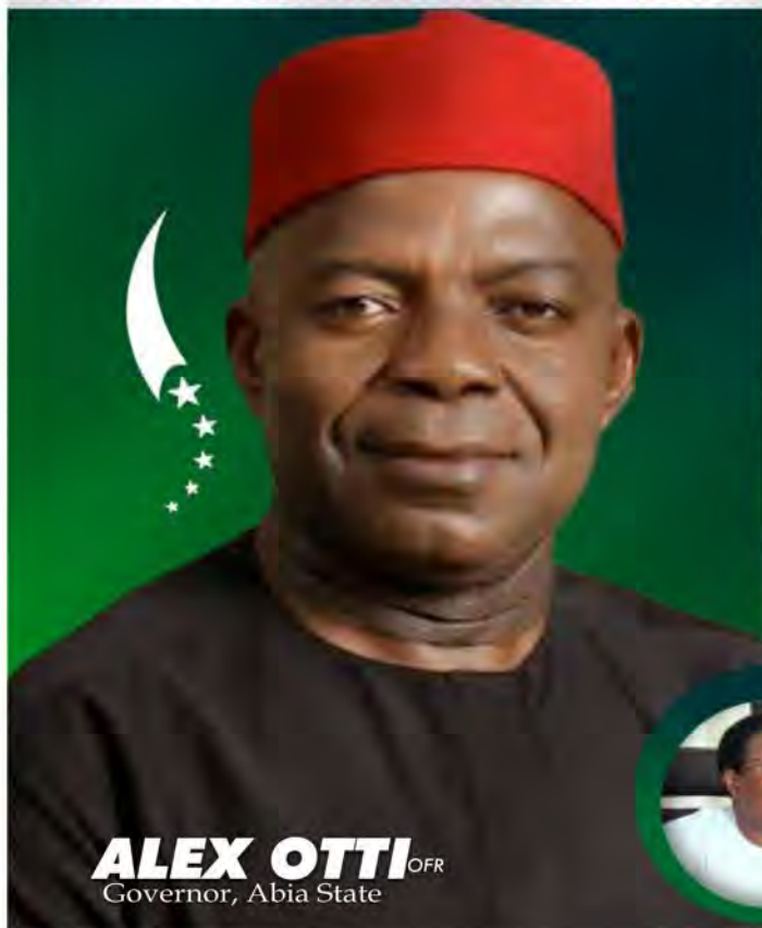
ALEX OTTI OFr Governor, Abia State

Long Live Abia State! Long Live Your Excellency.