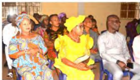
Some of the guests at the event