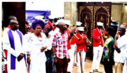
One of the side attractions at the event