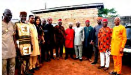
Arochuku LGA Labour Party Stakeholders at the event