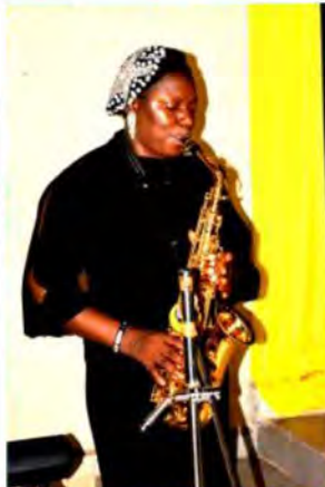
A saxophonist in action during the service