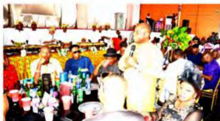
Another section of the guests