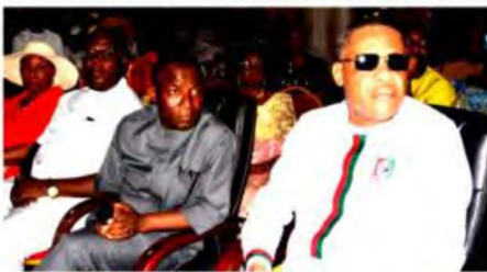
Hon. Obi Aguocha of the Fed. House of Reps (1st l) at the Church Service