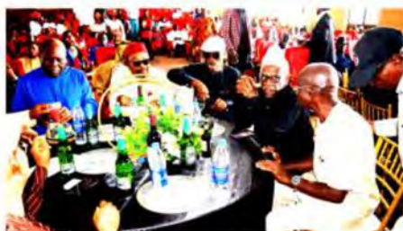
Guests being entertained