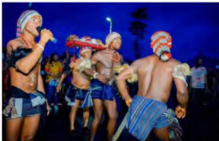
War Dancers Performing

particular ethnic cultures. We need to articulate a serious state policy that has to do with putting our culture together purposefully to unite the Igbo nations and achieve development at the end of the day. The envisioned Abia state policy thrust on culture and tourism must recognize the imperative of an intellectually driven cultural/tourism program. Tourism provides economic and employment opportunities. A key component within this envisioned Abia state policy thrust on culture and tourism strategy should be to increase tourism accessibility. ment, then we must really have to do our homework well and get our culture in such a way as to make it attractive. The black diaspora, the African Americans want to connect physically with us but there has to be something, a draw, that brings them here. Our tourism sites, like the Azumini blue river, the caves in Arochukwu etc, would have seen having constant inflows if we had done the right things from time.