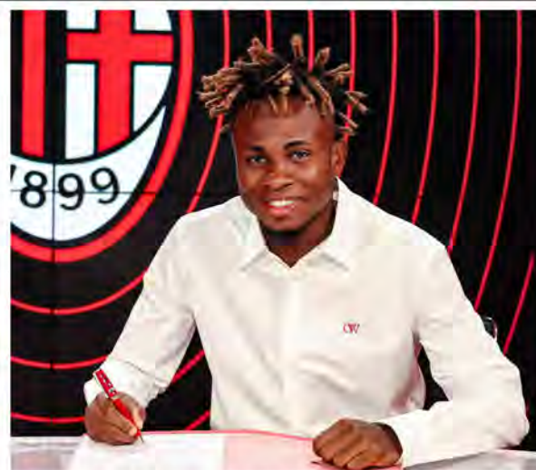
■ Samuel Chukwueze signing for AC Milan