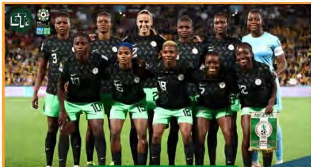
■ Super Falcons of Nigeria

As the Super Falcons file out against their round of 16 opponents next Monday, they are expected to display the fortitude that will help them equal their 1999 performance when they reached the quarter-finals of the World Cup.