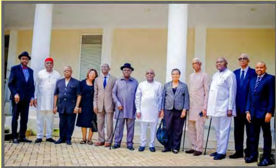
Abia State Governor, Alex Otti (6th right) in a group photograph with retired Judges in the state.