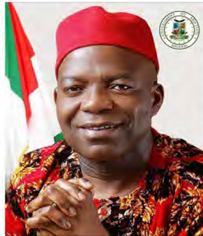
■ Gov. Chioma Otti

The government should also be lauded for coming up with the initiative. On its own part, the government should ensure, the enactment of relevant laws for the operation of TSA, adequate training of the relevant officers that will be involved in its implementation and operation and also continue to educate, sensitize and engage the general public, especially those doing business in Abia on the need to embrace TSA as the new normal as this will ensure smooth implementation, adoption and acceptance of TSA system by all.