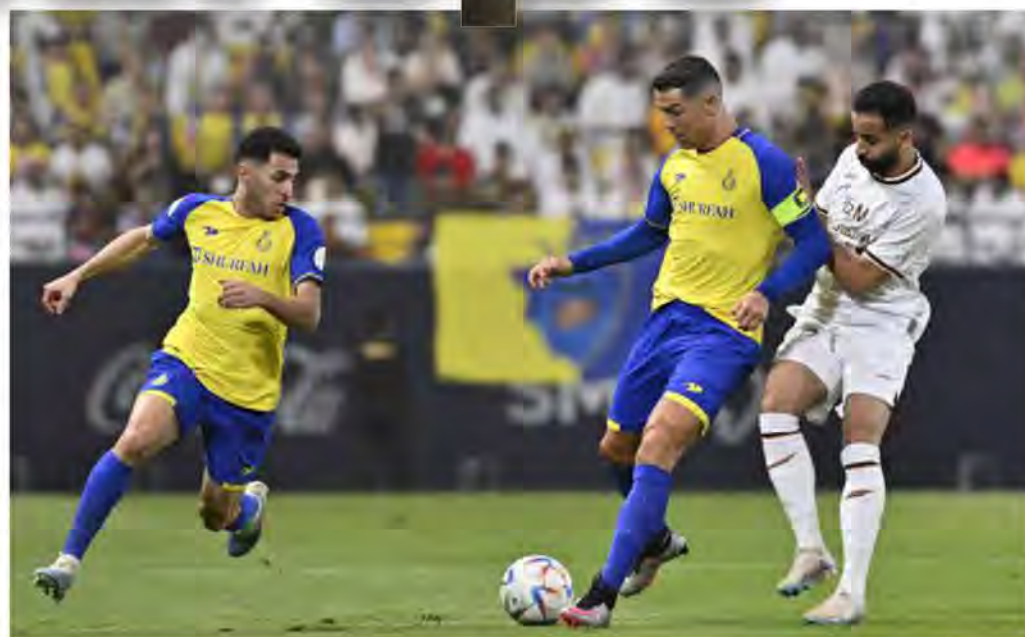
■ Cristiano Ronaldo in action for Al Nassr