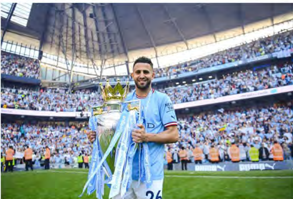
■ Riyad Mahrez won the UEFA Champions League with Manchester City last season.

He went for his former teammate Jordan Henderson who spent 12