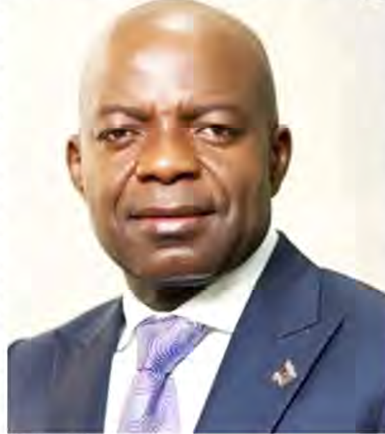
■ Governor Alex Otti

He also decried the trend whereby 70 percent of the national budget was spent on recurrent expenditure. The extent to which this can hinder societal development speaks for itself.