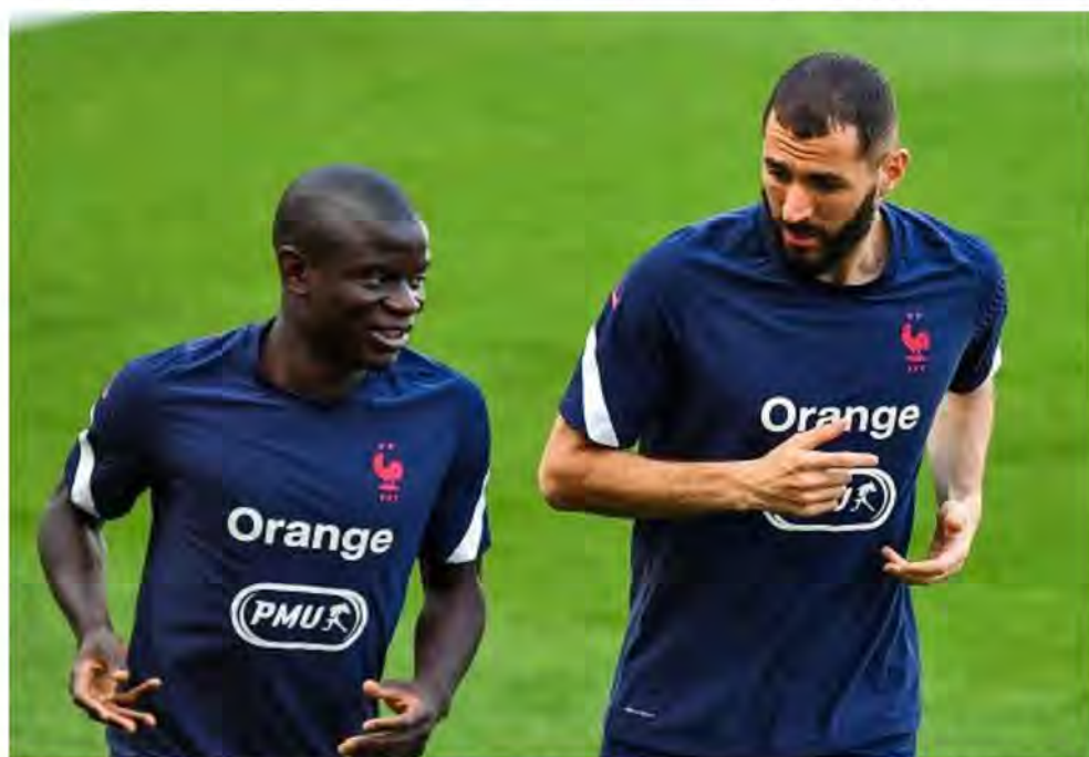
■ Kante(L) and Benzema(R) play together for France, they will also play together at Al Ittihad

In his eight season at the San Siro he won five major trophies. He will play alongside Ronaldo this season having signed for Al Nassr for £15m.