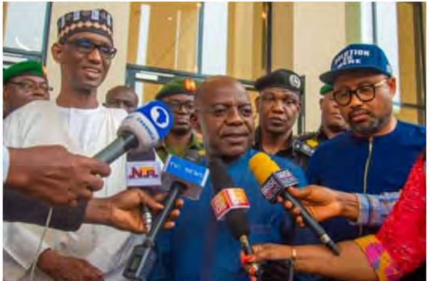
■ Abia state Governor, Dr Alex Otti flanked by the National Security Adviser, Mallam Nuhu Ribadu addressing journalists in Abuja after a meeting between the South-East governors and NSA on the security situation in the region.